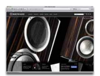
To discover how we reach music lovers all over the world, please visit: monitoraudio.com