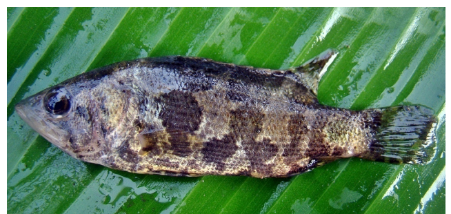
Figure 2: A fresh specimen of Nandus nandus collected from river Damodar at Bagnan, Howrah (12.8 cm Total Length).

Day [12] and Talwar and Jhingran [8], have earlier documented the morphological characters of Nandus nandus ; this has been summed up here. The body is deep and laterally compressed; its profile over the orbit is rather concave, while the abdominal part is nearly straight. Head is large, compressed with pointed snout. Eyes are large. Mouth is very large and protrusible. Teeth are in villiform bands on jaws.