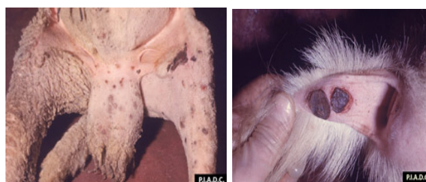
Figure 3: Benign form of sheep and goat pox.