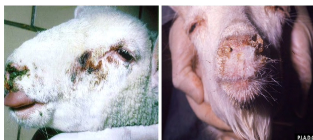
Figure 2: Malignant form of sheep pox.

Sheep and goat Pox can be diagnosed based on observable clinical sign like, fever, dyspnea and pox lesion in different parts of the unwooled skin. Clinical pathology and species of affected host are also important in the diagnosis of this disease. Epidemiology of the disease is also important in diagnoses of sheep and goat pox. As the virus of sheep and goat pox are very closely related it's indistinguishable by serologically. It appears that the host preference shown by these viruses with respect to either sheep or goats, accompanied by the case history, may be regarded as partially affirmative for either sheep pox or goat pox, but confirmatory diagnosis requires laboratory studies. It is also known that heterologous diagnostic reagents tend to be less efficient than homologous reagents for confirmatory diagnosis [38].