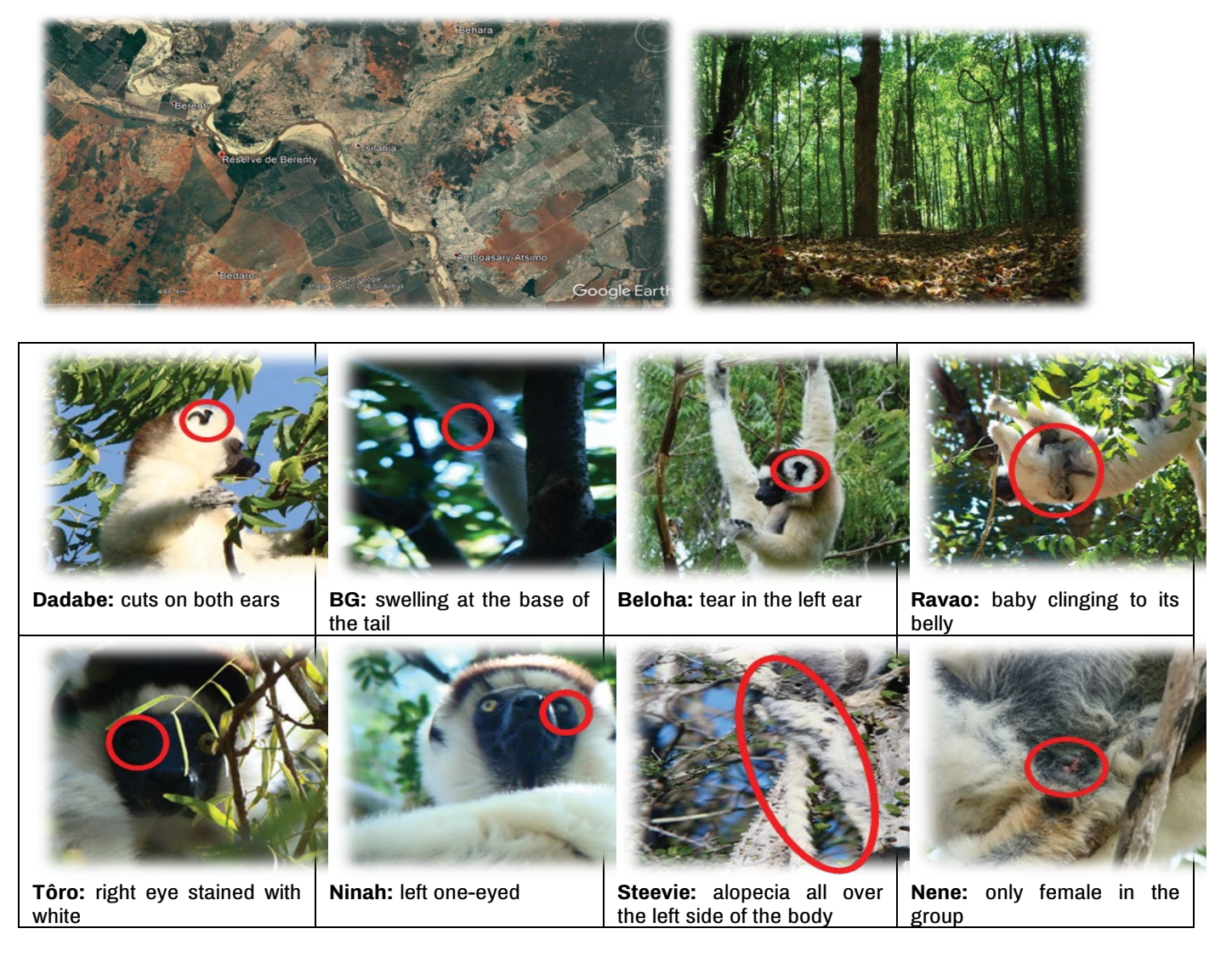
Figure 1. Study site images and focal individual identifications.

Table 2. Mean proportion repartition of studied Propithecus verreauxi diurnal activity.