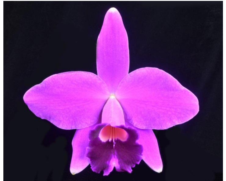
Left: Rlc Harriet Brickell 'Sebastian Ferrell' AM/AOS, grown by Orchid Eros Right: Cattleya pumila 'Mirtha Isabel' AM/AOS, grown by Orchid Eros