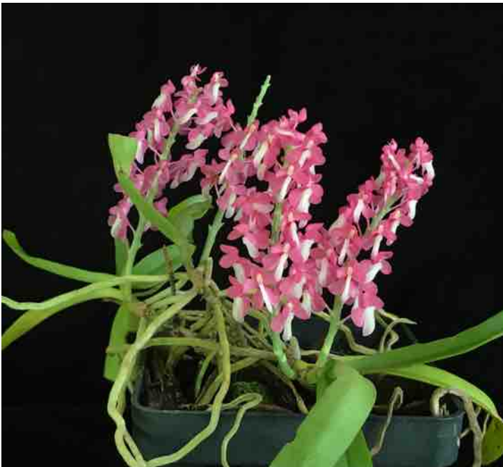
Left: 2 nd place: Dyakia hendersoniana , grown by Dorothy Imagire