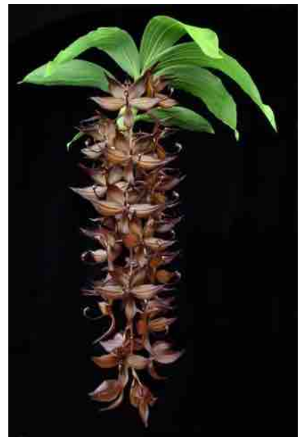
Left: Cattleya sanguiloba 'Orchid Eros' AM/AOS, grown by Orchid Eros Center: Cycnoches barthorum 'Jungle Mist Freckles' AM/AOS, grown by Jungle Mist Orchids Right: Cycnoches cooperi 'Mirtha Isabel' AM/AOS, grown by Orchid Eros