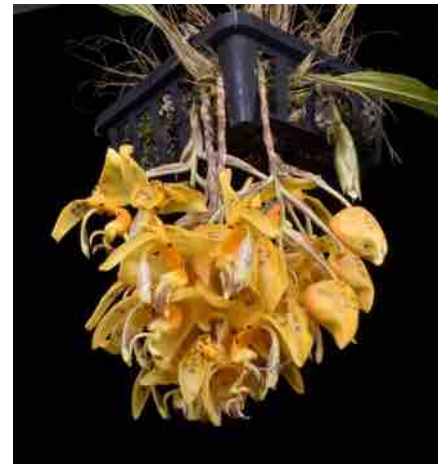
Left: Rlc Amazing Thailand 'Shogun Hawaii' AM/AOS, grown by Shogun Hawaii Center: Rlc Harriet Brickell 'Red Sky in Morn' AM/AOS, grown by Orchid Eros Right: Stanhopea jenischiana 'Okika' AM/AOS, grown by Okika