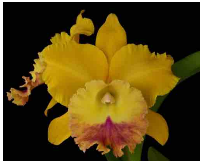
Left: Rlc Siam Pacific Delight 'Shogun' AM/AOS, grown by Shogun Hawaii Right: Rlc Mem. Buranaphan Nikom 'Bangkok Yellow' HCC/AOS, grown by Shogun Hawaii