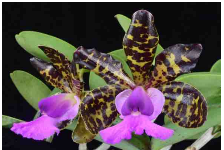
Left: Cattleya aclandiae 'Aglaia' HCC/AOS, grown by Orchid Eros Right: Cattleya aclandiae 'Apollo' AM/AOS, grown by Orchid Eros