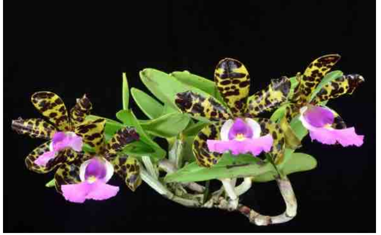
Left: Cattleya jenmanii (f. alba ) 'Islinger' AM/AOS, grown by Orchid Eros Right: Cattleya aclandiae 'Melpomene' AM/AOS, grown by Orchid Eros