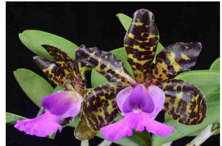
Left: Cattleya aclandiae 'Aglaia; HCC/AOS, grown by Orchid Eros Right: Cattleya aclandiae 'Apollo' AM/AOS, grown by Orchid Eros