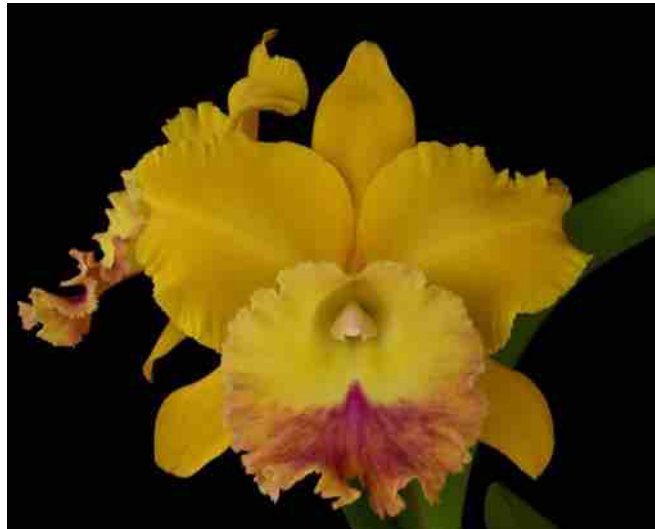
Left: Rlc . Siam Pacific Delight 'Shogun' AM/AOS, grown by Shogun Hawaii Right: Rlc . Mem. Buranaphan Nikom 'Bangkok Yellow' HCC/AOS, grown by Shogun Hawaii