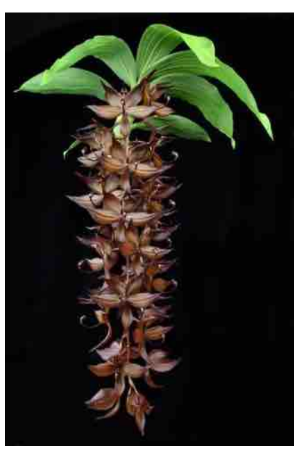
Left: Cattleya sanguiloba 'Orchid Eros' AM/AOS, grown by Orchid Eros Center: Cycnoches barthorum 'Jungle Mist Freckles' AM/AOS, grown by Jungle Mist Orchids Right: Cycnoches cooperi 'Mirtha Isabel' AM/AOS, grown by Orchid Eros