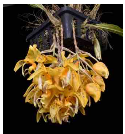
Left: Rlc Amazing Thailand 'Shogun Hawaii' AM/AOS, grown by Shogun Hawaii Center: Rlc . Harriet Brickell 'Red Sky in Morn' AM/AOS, grown by Orchid Eros Right: Stanhopea jenischiana 'Okika' AM/AOS, grown by Okika