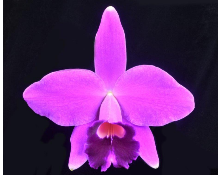
Left: Rlc . Harriet Brickell 'Sebastian Ferrell' AM/AOS, grown by Orchid Eros Right: Cattleya pumila 'Mirtha Isabel' AM/AOS, grown by Orchid Eros