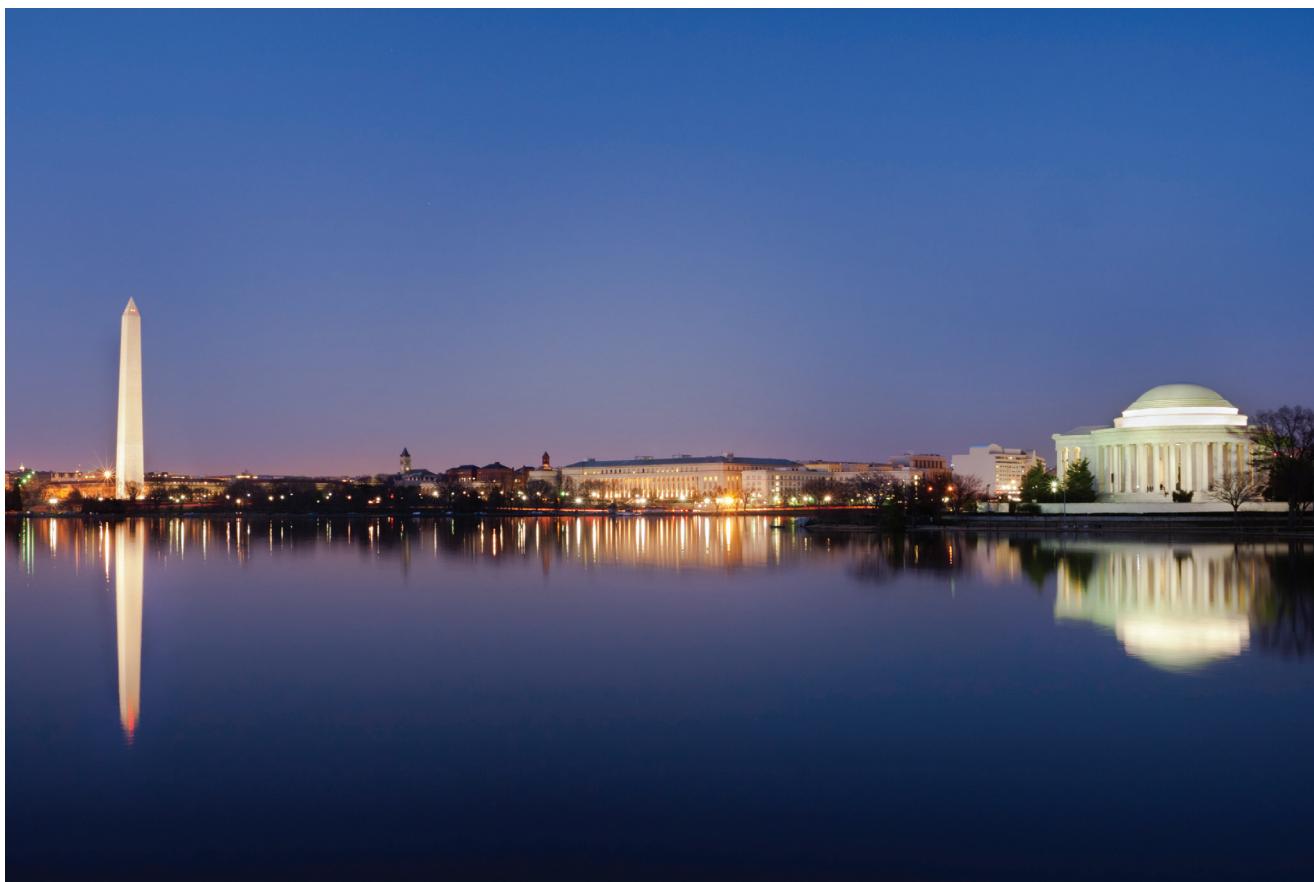
The National Mall at dusk.