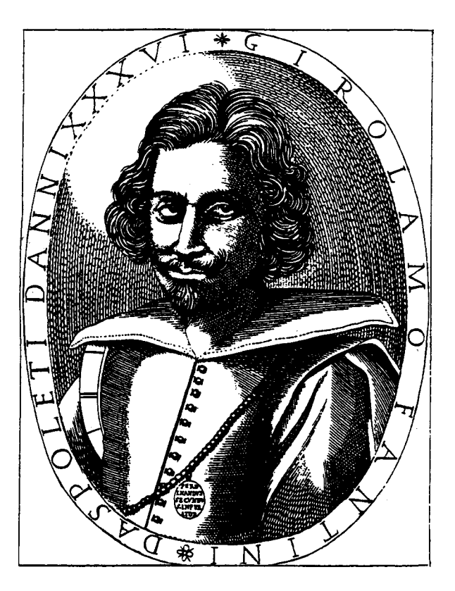
Figure 1 Girolamo Fantini, from Modo per imparare a sonare di tromba (1628).

"Girolamo Fantini da Spoleti" is how the name is given on both the frontispiece and in the portrait appearing on the second page of his famous publication [see Figure 1], and "Girolamo Fantini da Spuleti" in the book Debitori e creditori 1628-1633 of the Medicean guardaroba ["wardrobe," or listing of suppliesb<sup>4</sup> It is therefore Spoleto, in Umbria, from