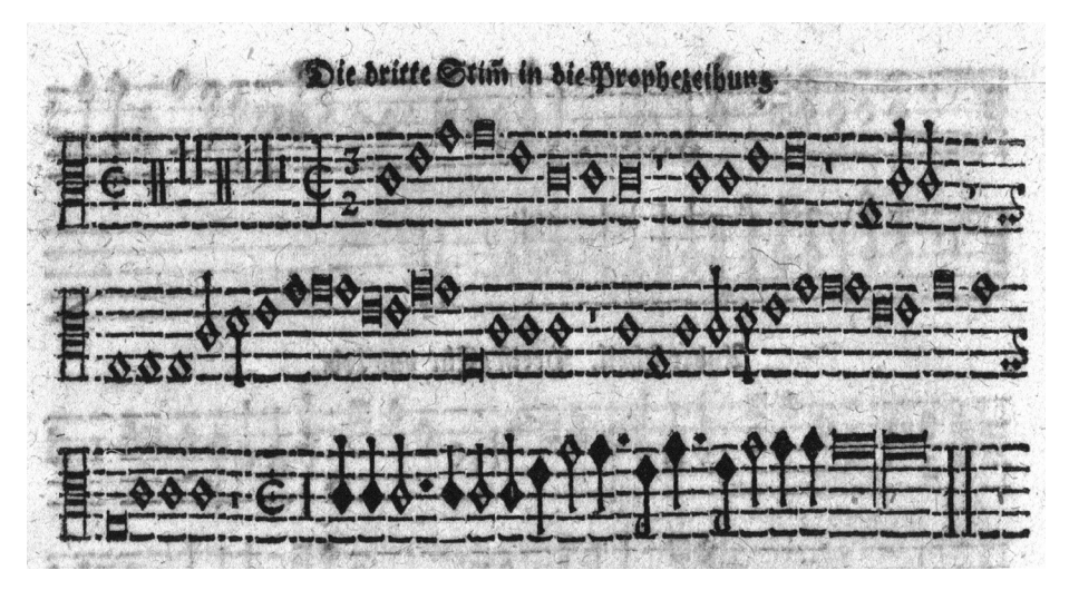
Figure 1: Michael Altenburg, Die Prophezeihung von Luthero, Die dritte Stimme , showing "normal" phrases with natural harmonics juxtaposed with "unusual" phrases that include non-harmonics. D-MLHr Stadtarchiv Mühlhausen 10/ E6 n.32, fol. 78r.

Beneath the two Claret parts are found either one or two parts that are written in C3 clef and use the span g-g^{1} . The single C3-clef part is described as dritte Stimme in 1617 and as Trombet in 1620, while the two C3-clef parts in the 1622 work are both primarily described as for Trombet . All of these parts are unusual on three counts. First, while the standard trumpet ensemble (one each of Clarino, Principal, AlterBass, Volgan, and Grob trumpet parts, with timpani) used by Schütz and modified by Prætorius (who allows for the almost obsolete sixth Fladdergrob trumpet part and adds an optional second Clarino part) and others is based on the presence of a leading Principal trumpet part using the C1 clef and with the normal range c^{1} , e^{1} , g^{1} , and c^{2} , such a part is avoided by Altenburg, possibly to preclude incurring the wrath of court trumpeters, of whom