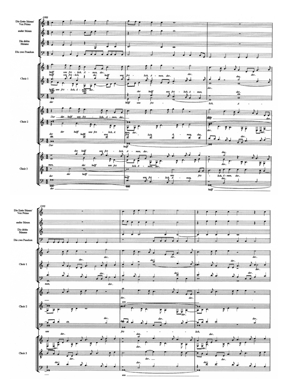
Example 2: Das Lutherische Schloβ : "Ein feste' Burg," mm. 180–90.