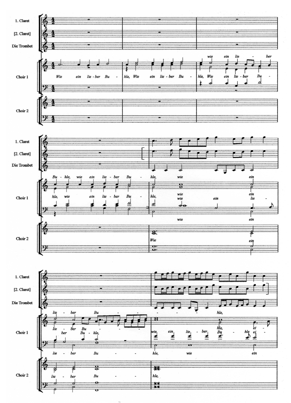
Example 3: "Wie ein lieber Buhle einen Buhlen Lieb hat," mm. 1–7.