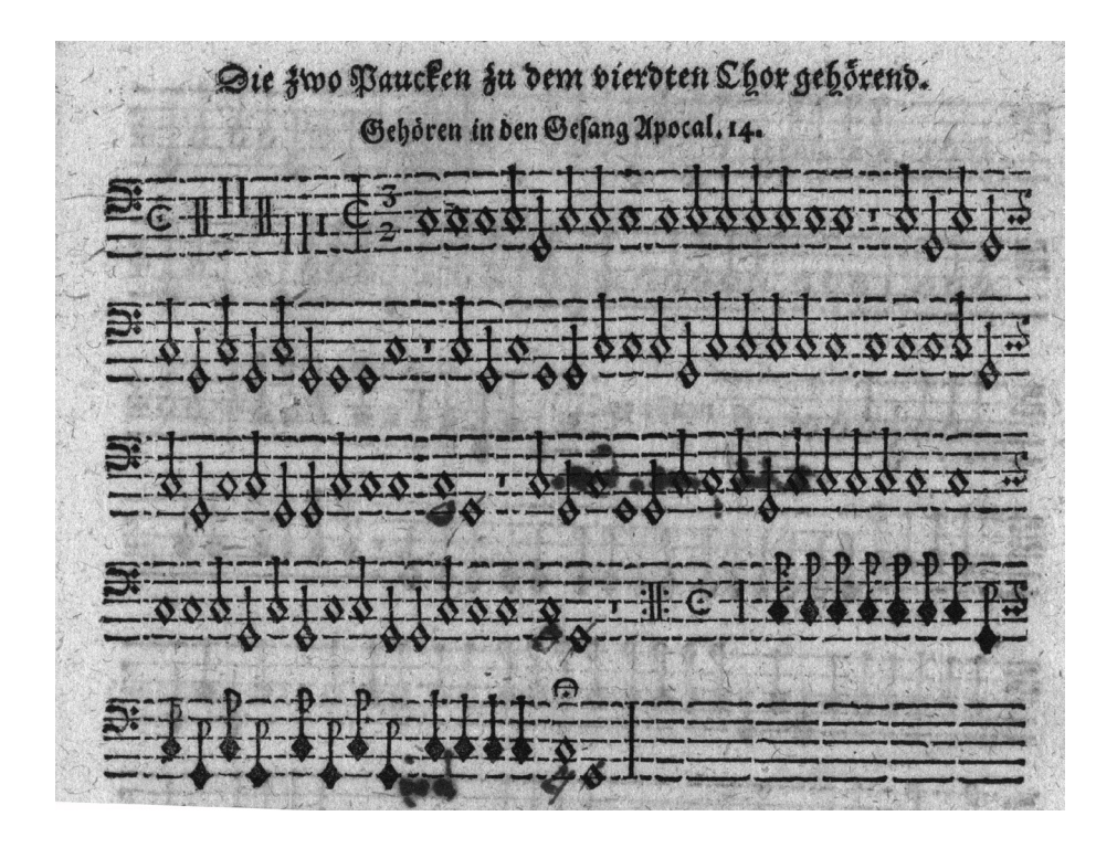
Figure 3: Die Prophezeihung von Luthero, timpani part, showing manuscript verification of the simultaneous sounding of both kettledrums at intermediate clausulæ (systems 3 and 4) and the clausula finalis (system 5). D-MLHr StAM10/ E6 n.32, fol. 80r.

Psalm 150 includes a novel trumpet choir comprising two Claret parts (played on natural trumpets) and three Trombet parts (designed for trombones), a particular ensemble that was probably invented by Altenburg. The same ensemble reappears in Andreas Rauch's Currus Triumphalis Musici from 1648, which has similar anomalies in its three lower Tuba parts.<sup>27</sup> Its influence can be witnessed much later when sufficient trumpet players were available in the towns and villages and composers had ceased to