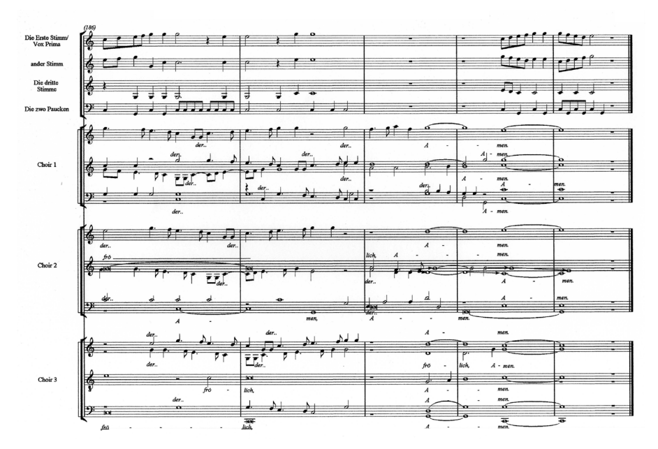
Example 2 (cont.): Das Lutherische Schloβ: "Ein feste' Burg," mm. 180–90.