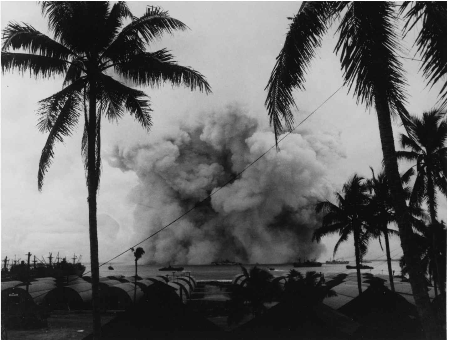
USS Mount Hood (AE-11) explodes in Seeadler Harbor, Manus, Admiralty Islands, 10 November 1944, as seen from the Naval Supply Depot on Manus (NH 95404).