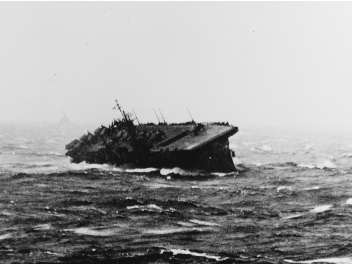
USS Langley (CVL-27) rolling sharply during extreme weather conditions in the Pacific, likely Typhoon Cobra, 14–19 December 1944 (80-G-305484).