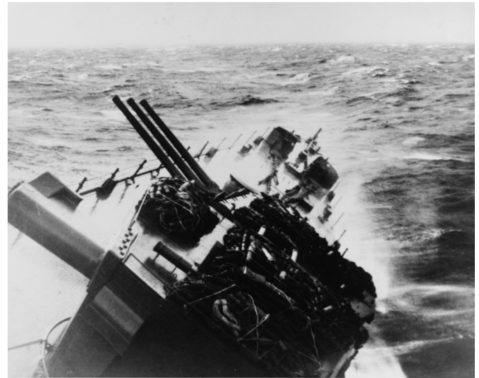
USS Santa Fe (CL-60) shown rolling about 35 degrees to starboard as she rides out a typhoon encountered in the South China Sea, probably Typhoon Cobra, 14–19 December 1944. Note that her forward 6-inch/47-caliber gun turret is trained to one side to avoid shipping water through its gun ports (80-G-700024).