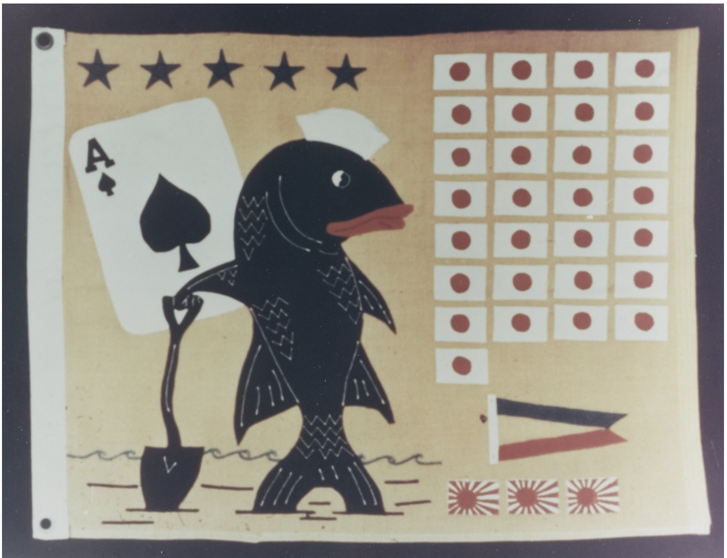
World War II battle flag of USS Spadefish (SS-411) (NH 66212-KN).