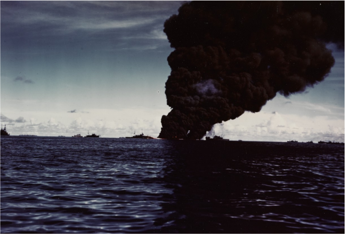
USS Mississinewa (AO-59) sinking at Ulithi, 20 November 1944, after being struck by a Japanese Kaiten Type 1 manned torpedo. The capsized ship's bottom can be seen at the base of the flames and smoke pillar, with bow or stern toward the left (80-G-K-5510).