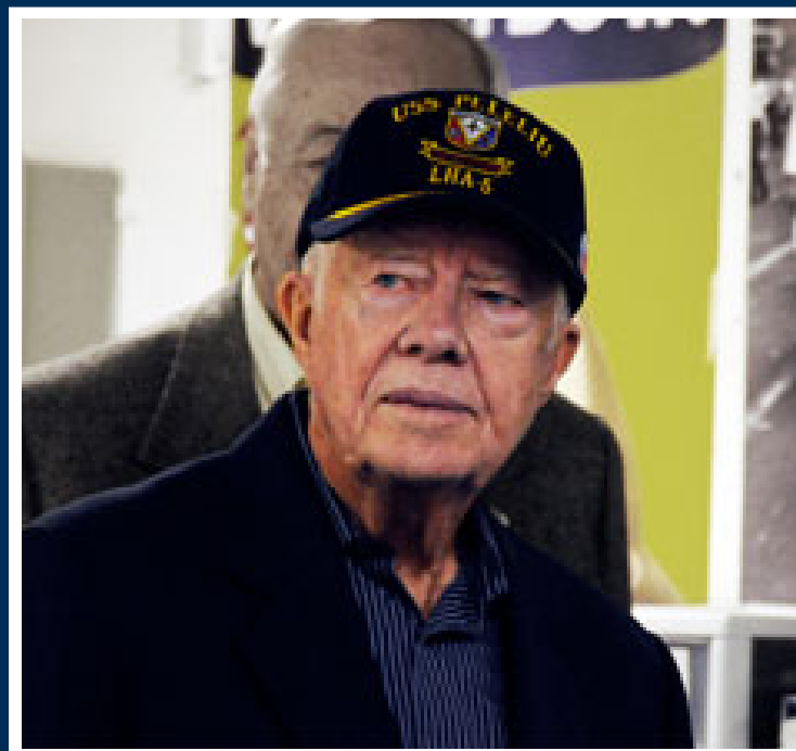
James Earl (Jimmy) Carter Jr. Lieutenant