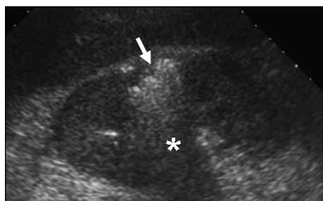
FIG 1. Longitudinal scan of the right kidney showing echogenic foci of air (arrow) inside the renal parenchyma. Note the 'dirty' shadow (*)