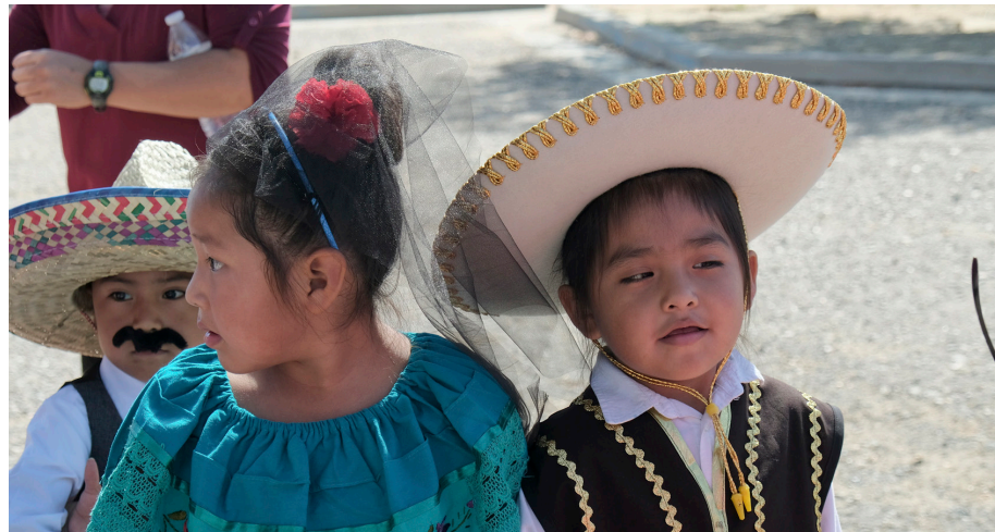
Kindergarten students wait for the singers to start singing. They danced the Mexican Dance. A young boy and his partner wait to enter the plaza