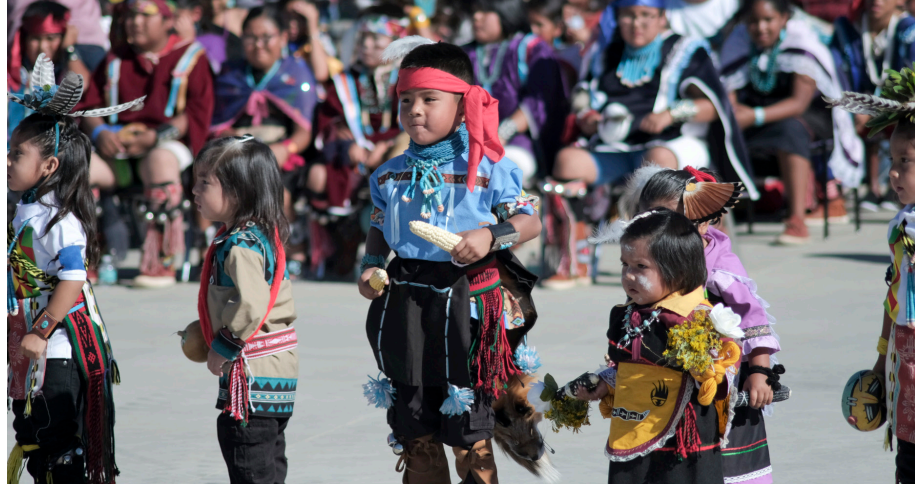
The Hopi Day Care students dancing the Corn Dance. Happy students display their dance skills to the community.