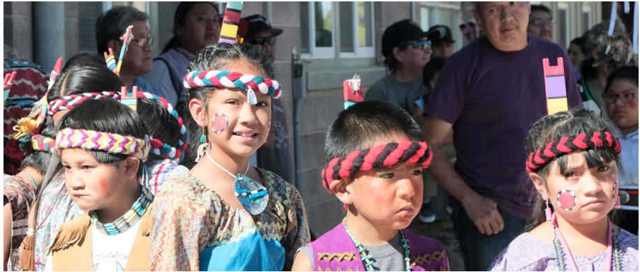
Second grade students dancing Supai or camp dress Supai.