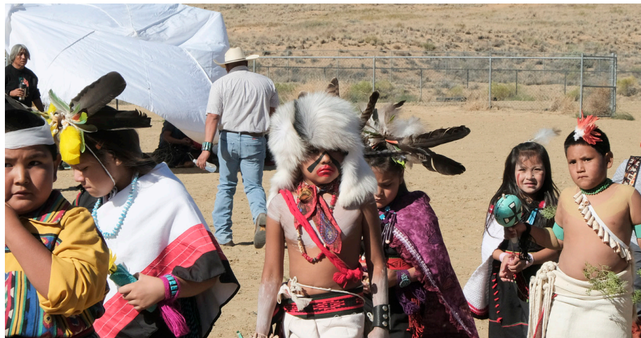
Second Mesa students dancing the throw-away dance. Students get in line to enter the plaza.