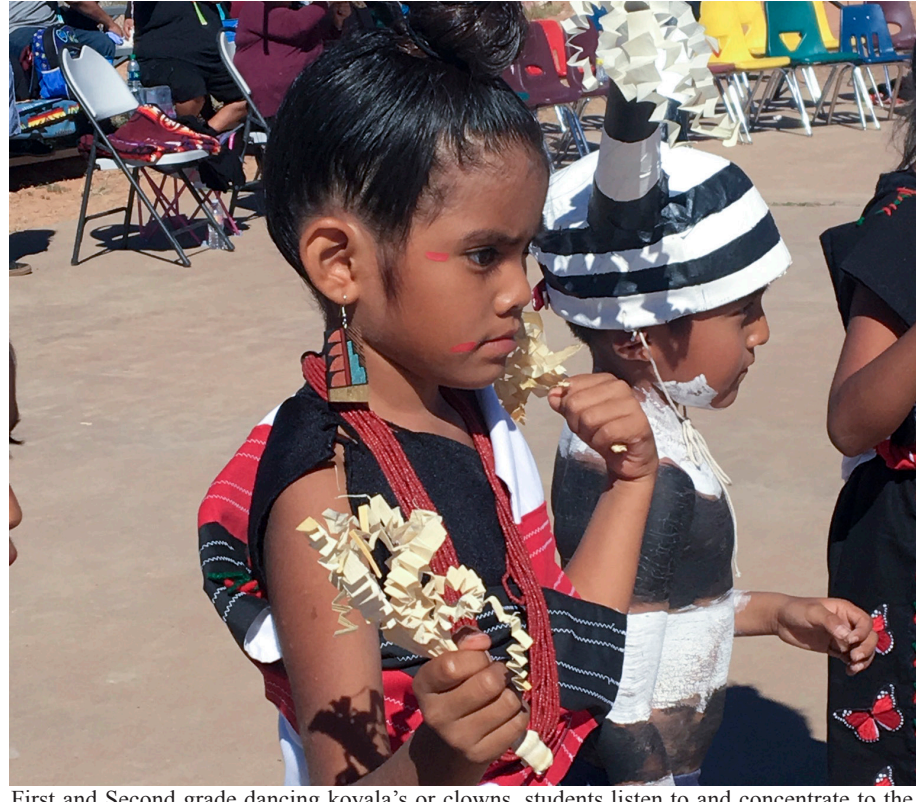
First and Second grade dancing koyalas or clowns, students listen to and concentrate to the song.

Keep your family safe from accidental ingestions and overdoses – safely dispose of unused medications!