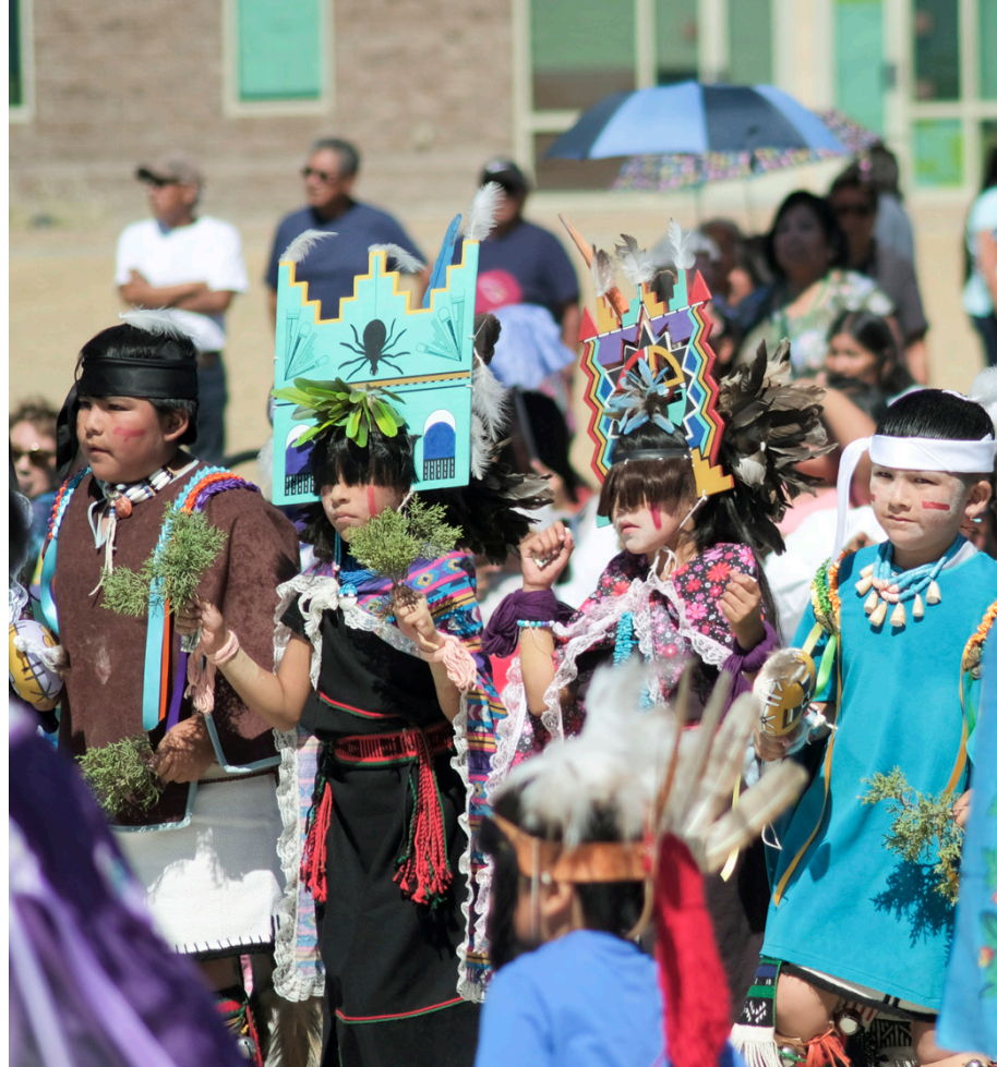
Several grades teamed up from Second Mesa school to dance the traditional Hopi butterfly dance. Students here are dancing in sync with the drum beats.