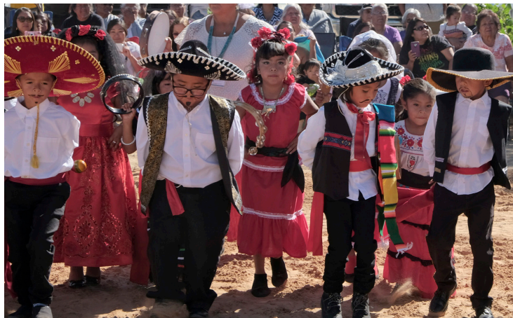
First grade Hotevilla Bacavi community students dance the Mexican line dance.