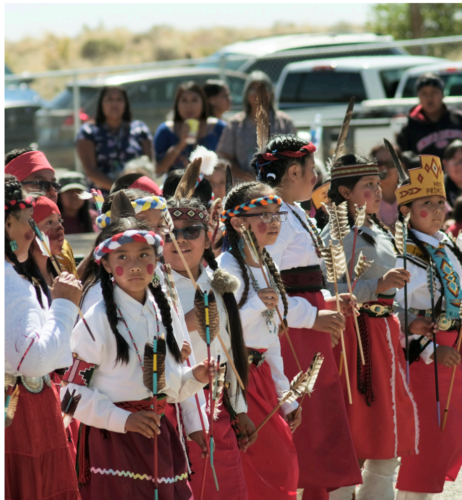
Fourth grade students dancing Piyotsi or the Apache arrow dance. The girls are concentrating on the song.