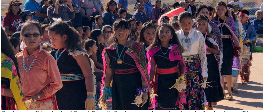
Students walking in the "Grand Entry". Students are dressed and ready for the dance