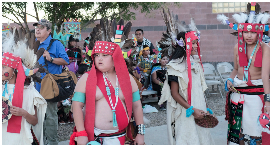
Sixth grade students dance the Kooniam or fancy Supai dance. They are waiting to enter the plaza in front of the school.