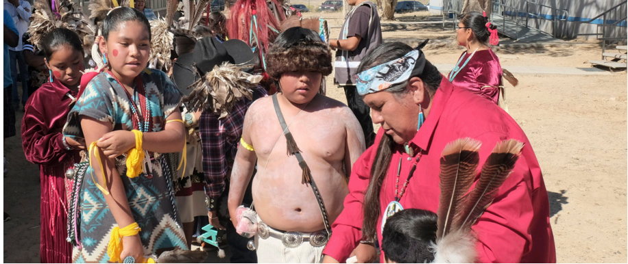
Third and Fourth grade students have a final check before they enter the plaza.