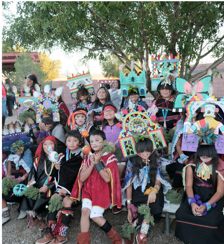
Fourth grade students dance the traditional Hopi Butterfly dance. They are waiting for their turn to dance, as they sit and pose for a group picture.