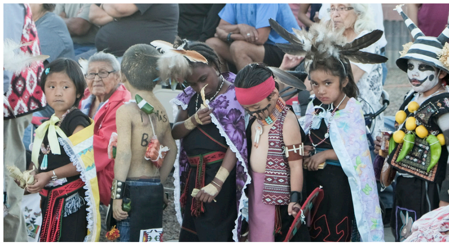
Kindergarten and first grade students wait for the singers to start singing. They danced the "throw away dance"