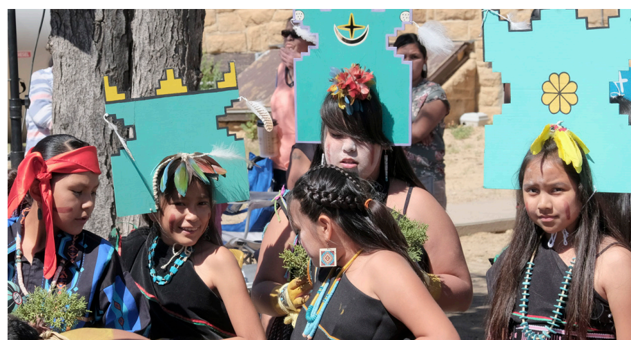
Fifth grade dancing the Santo Domingo Butterflies, girls from the Fifth grade check their head-dress before entering the plaza