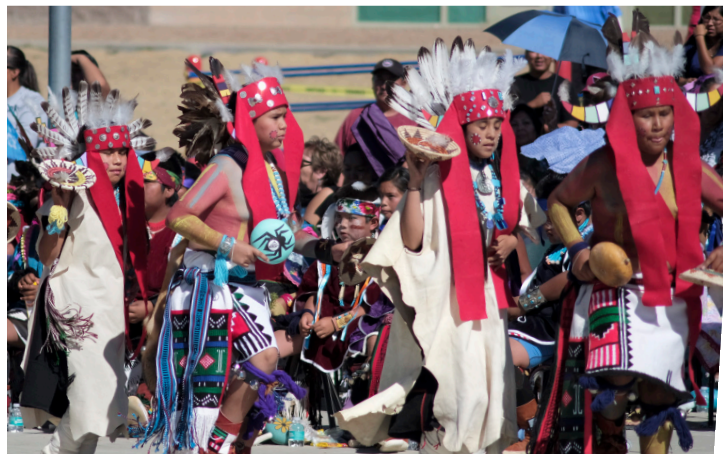
Second Mesa students dance fancy Supai or Kooniam.