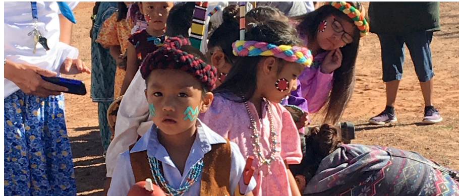
Kindergarten students danced the Supai or Camp dress dance.