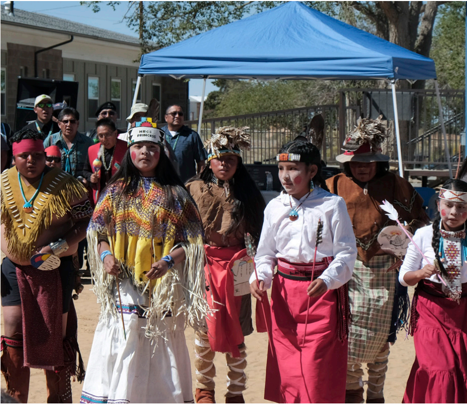
Sixth grade students dancing Piyotsi or the Apache arrow dance. Miss HBCS princess dancing to the beat.