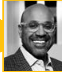
NIRAJ SHAH Wayfair CEO & Co-Founder 2019