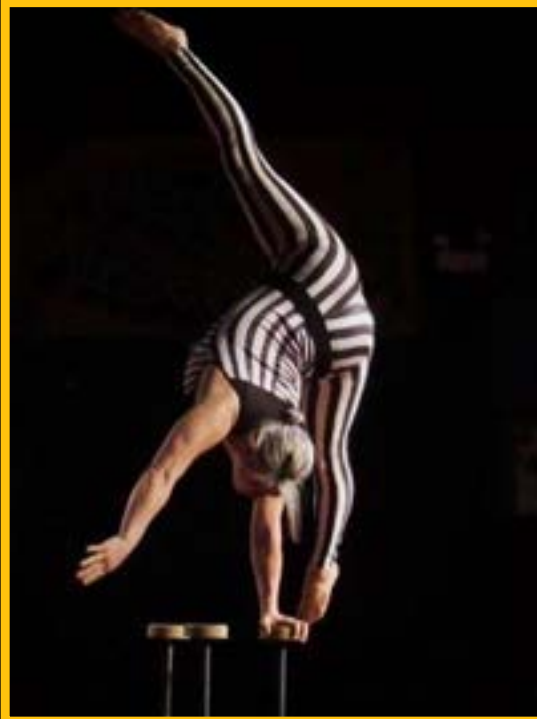
ALOFT CIRCUS ARTS