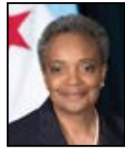
LORI E. LIGHTFOOT MAYOR