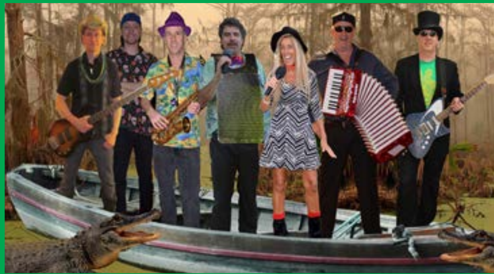
ZYDECO VOO DOO BAND