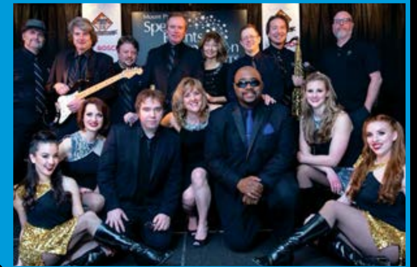
ORCHESTRA 33's PARTY GRAS BAND