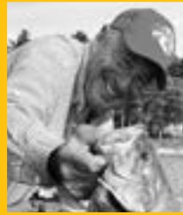
JOHNNY MORRIS Bass Pro Shops Founder & CEO 2020