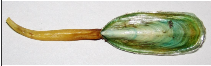
Lingula sp.