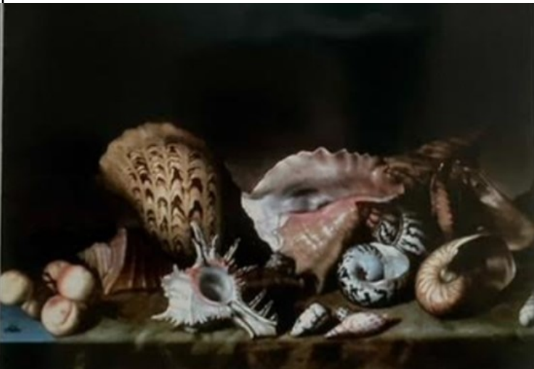
LIFE IMITATING ART