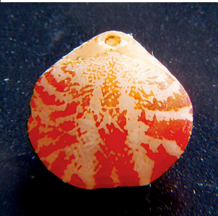
Frenulina sanguinolenta , Dwergenpaartje, cc-by-sa-3.0 both from Wikimedia Commons