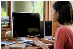
Slimline PC, fits almost anywhere.