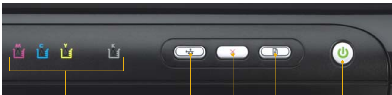
Ink cartridge status LEDs