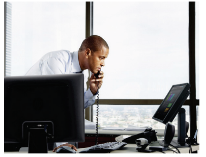
Simple one-to-one device management

The MFP can also be managed using the HP Embedded Web Server (EWS). Use a web browser to monitor status, configure network parameters, or access device features.