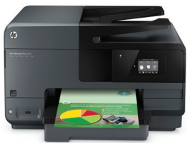
HP Officejet Pro 8610 e-All-in-One

Print professional color for up to 50% lower cost per page than lasers with an e-all-in-one engineered for business printing. 1 Cruise through high-volume printing tasks and help keep business moving with convenient mobile printing features. 3