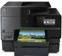
HP Officejet Pro 8630 e-All-in-One