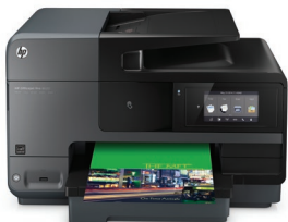
HP Officejet Pro 8620 e-All-in-One