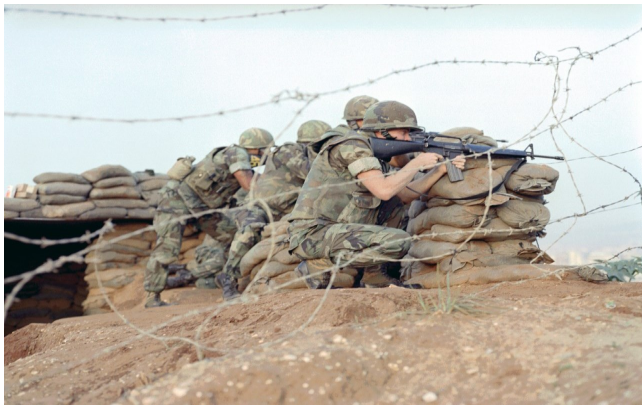
U. S. Marines armed with M16 rifles took cover behind sandbags during a terrorist attack, 1 April 1983. The Marines deployed to Lebanon as part of a multinational peacekeeping force following confrontation between Israeli Forces and the Palestine Liberation Organization. (National Archives identifier: 641703)