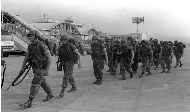
U. S. Marines marched across the runway apron of Beirut International Airport in Lebanon upon their arrival (National Archives identifier: 6370471)