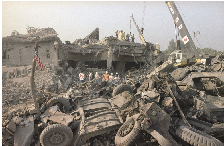
This is the scene in the aftermath of the bombing of the U.S. Marines barracks in Beirut, Lebanon, Oct. 23, 1983.