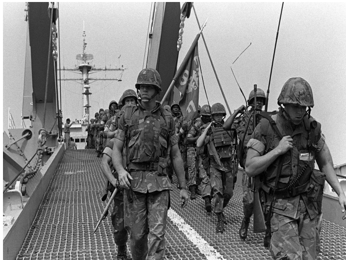
Marines from the 32d Marine Amphibious Unit walked down the row ramp of tank landing ship USS Manitoewoc (LST-1180). (National Archives identifier: 6370377)