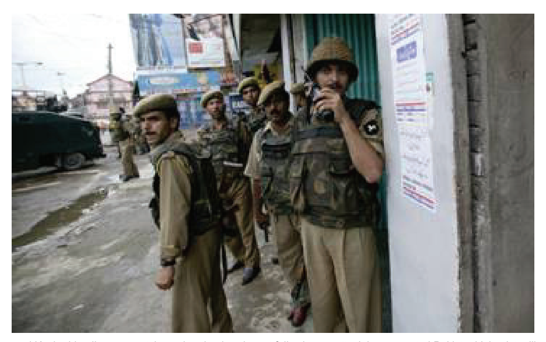
Indian and Kashmiri policemen watch as shooting breaks out following an attack by suspected Pakistani Islamist militants in the center of Srinagar's business district, July 29, 2005.

Although India has internal systems of inquiry and punishment, Human Rights Watch—despite several letters requesting the information from the Indian government—has received no details of any cases in which members of the Indian security forces have been prosecuted and convicted for serious human rights violations. In March 2006, Chief Minister Ghulam Nabi Azad said that 134 army personnel, seventy-nine members of the Border Security Force, and sixty policemen have been punished for committing human rights abuses since the insurgency first began. However, as no details of these incidents are available and the chief minister claimed at the same time that there were only 122 complaints of human rights violations since 2002, these figures cannot be taken at face value, and the commitment to transparently investigate, prosecute and punish individuals responsible for abuses remains in doubt. Instead, soldiers, paramilitaries, and police are routinely shielded by both their uniformed and civilian superiors in Jammu and Kashmir and New Delhi and by laws that make it extremely difficult to prosecute members of the armed forces in civilian courts.