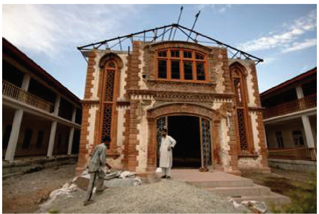
Laborers work on the reconstruction of the renowned Islamia High School in downtown Srinagar, August 2, 2005. The school suffered an arson attack in early 2005 by Pakistani-supported Islamist militants as a warning to the Kashmiri owner and religious leader of the school not to negotiate with the Indian Government over Kashmir's independence.

Militants in Kashmir have long been responsible for attacks on schools and for recruiting children into their forces. International humanitarian law prohibits attacks directed at civilians and civilian objects. Schools are protected as civilian objects, while teachers and students fall under the protection granted to civilians unless they are taking a direct part in hostilities.<sup>586</sup> International law also prohibits the recruitment and use of children as soldiers and in other combat-related roles.<sup>587</sup> The prohibition on the recruitment and use of children below the age of fifteen is now considered customary international law, and is binding on all parties to armed conflict.<sup>588</sup> This standard is also reflected in the Convention on the Rights of the Child, which India ratified in December 1992.<sup>589</sup> The Optional Protocol to the Convention on the Rights of the Child on the involvement of children in armed conflict, which India ratified in November 2005, prohibits state armed forces and rebel groups from recruiting or using in hostilities persons under the age of eighteen years.<sup>590</sup>