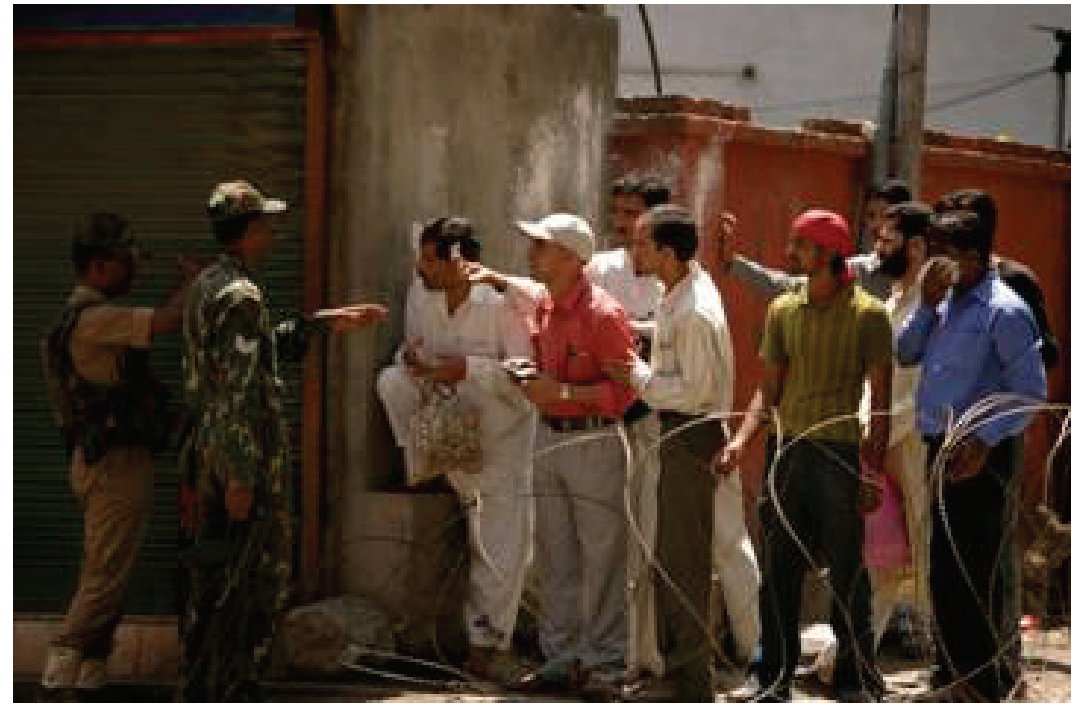
Indian paramilitary soldiers check the ID of local Kashmiri men trying to gain access to their offices the day after an attack by suspected Pakistani Islamist militants in the center of Srinagar's business district, July 30, 2005. Militants opened fire on nearby Indian security positions, stopping afternoon rush hour traffic and pinning down hundreds of soldiers and police. Five security men were killed and six other people were wounded, including local journalists caught in the crossfire. Two of the suspected militants were killed.

three, most of them civilians.<sup>484</sup> On May 22, 2006, two militants opened fire at a Congress party rally in Srinagar, killing six, including three civilians, and injuring thirty-five; the militants were also killed. Two militant groups, Lashkar-e-Toiba and Al Mansoorian, claimed responsibility.<sup>485</sup>