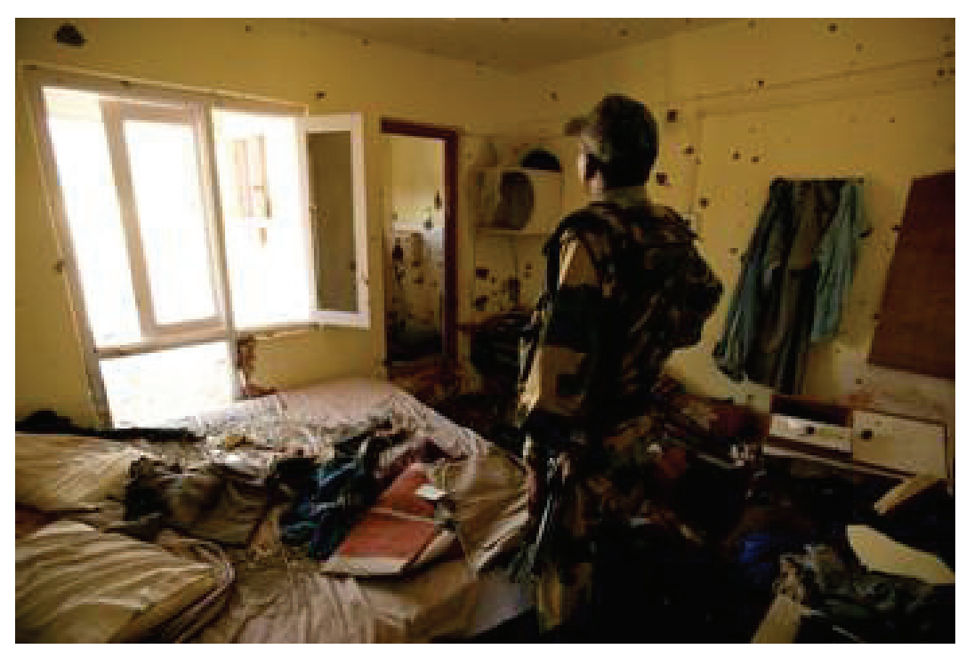
A day after an attack in the center of Srinagar's business district on July 29, 2005, Indian paramilitary soldiers inspect a room where a suspected Pakistani Islamist militant was killed.

He, along with several other Kashmiri rebel leaders, traveled to Pakistan several times to talk to Pakistani political leaders and meet with the militant groups based in Pakistan.<sup>523</sup> After one such meeting, however, Syed Salauddin of Hizb-ul-Mujahedin, who also leads the United Jihad Council, stated: "The need for an organized and massive armed struggle has increased today more than ever and the Kashmiri youth need to prepare themselves for fighting in maximum numbers"<sup>524</sup>