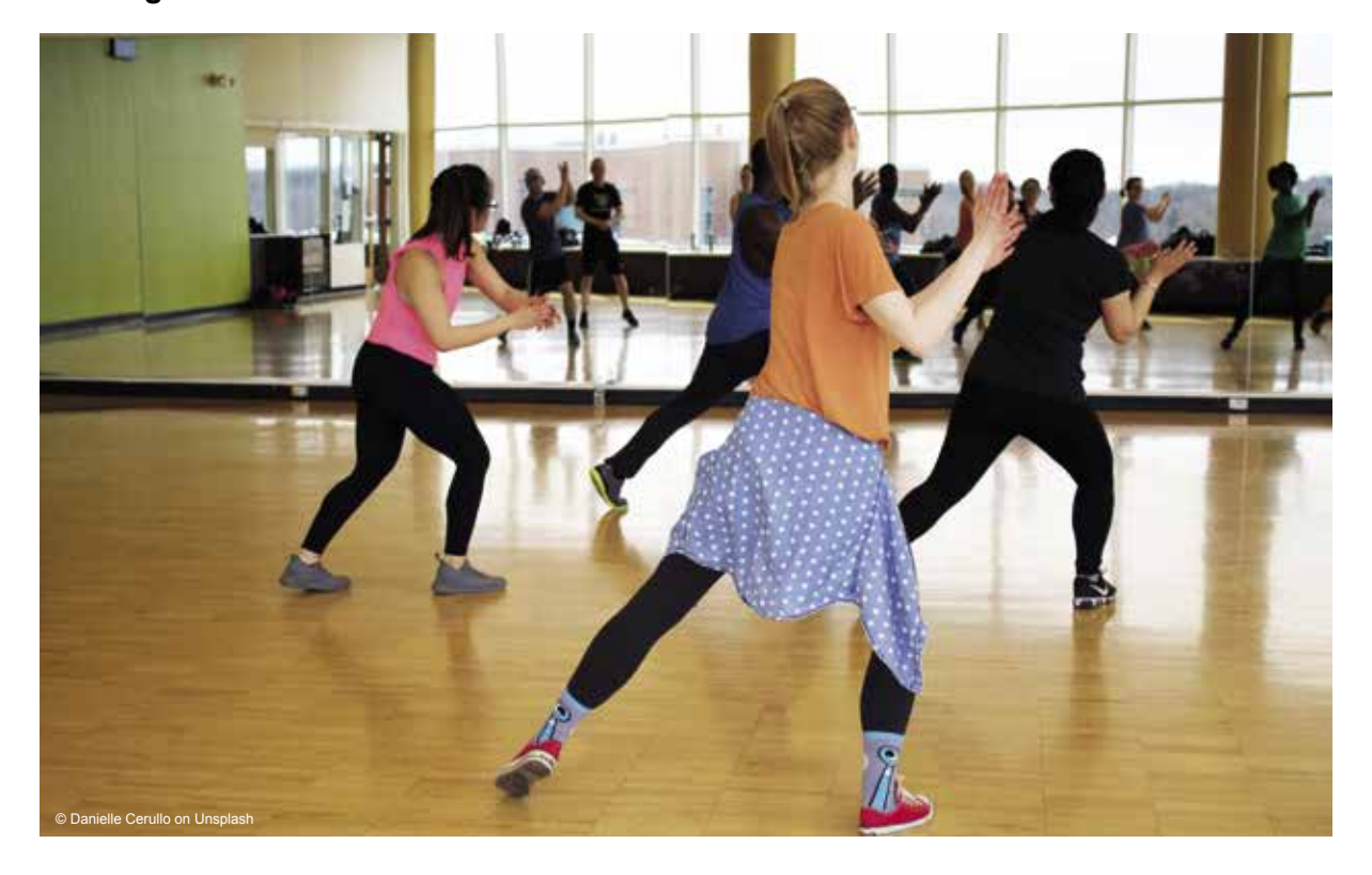
"Dance can help restore joy and stability in troubled lives and ease the tensions in schools that are disrupted by violence and bullying"<sup>6</sup>

Dancing is known everywhere in the world. There is a bit of a gender tendency towards females as participants, but you never know. In our view, dancing is one of the best activities for a sports and learning program. The circumstances of the Covid-19 pandemic have made this even more visible, which we will illustrate further below. Dancing brings people from anywhere together. It can be done alone or as a group.