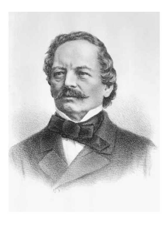
Figure 10. Friedrich Martin Joseph Welwitsch.

Verde Islands, but he only got as far as Lisbon and so sent material only from Portugal. He was appointed head of the botanical garden of Ajuda (Lisboa), and his collections for the Reiseverein were delayed and incomplete. This was the last regularly distributed material of the Reiseverein (Hochstetter and Steudel 1842). For a biography, see Dolezal (1959). Specimens are at STU. See also Stafleu and Cowan (1988, 7:174–178) and Vegter (1988, 7:1136).