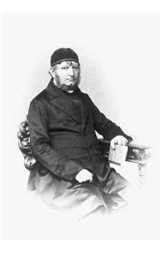
Figure 6. Heinrich Joseph Guthnick. Photograph by C. Durheim, Bern, Switzerland, 1870. Courtesy of Hunt Institute for Botanical Documentation.

Basler Mission. He was first acknowledged in 1831 (Hochstetter and Steudel 1831), sent material-175 species-from the Caucasus in 1833 (Hochstetter and Steudel 1834), and collected at Elisabethopol (Yelizavetpol, now Gäncä) and Helenendorf (now Xanlar), both former German settlements in Azerbaijan, where he lived until 1841. Further lots came in 1835 (Kurr 1836) and 1838 (Hochstetter and Steudel 1838b), a total of 6 by 1839 (Hochstetter and Steudel 1839). From about 1842, Hohenacker, after moving to Esslingen, edited many series of exsiccate (Lanjouw and Stafleu 1957, 2(2):281). They, however, are not connected to the Reiseverein. There is much material at STU and TUB. For a detailed