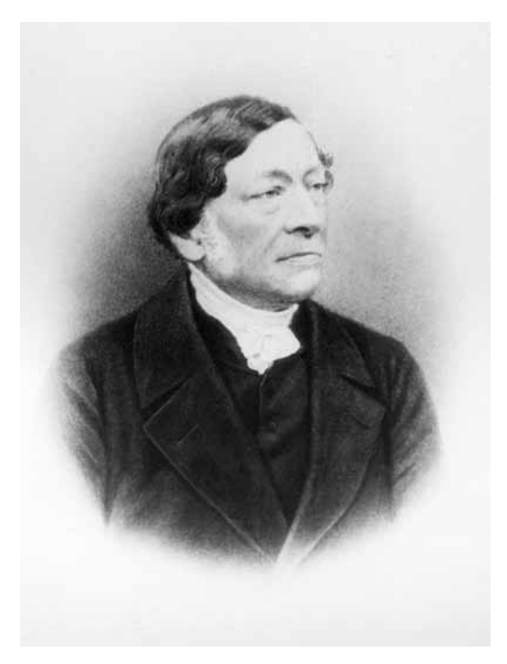
Figure 1. Christian Ferdinand Hochstetter.