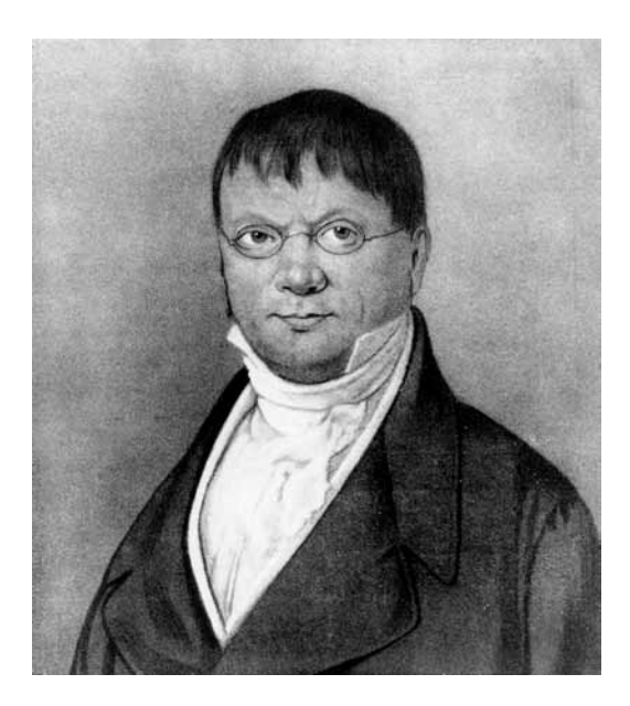
Figure 2. Ernst Gottlieb Steudel.

In 1825 Hochstetter and Steudel launched an appeal in a regional agricultural journal (Hochstetter and Steudel 1825; see also Baur 1970) for the founding of the Reiseverein. In April 1826 an independent leaflet was published and sent to interested persons, one copy of which is extant in the STU archive (Fig. 3). It is in Latin and intended for an international scientific public. The original aim was to collect as many duplicates as possible of herbarium specimens, living plants, and seeds. Later fossils, minerals (collected mostly by Kurr) and mollusk shells were included. The material was to be distributed among the members in proportion to the amount of money they had invested. The minimum was 15 Rhenish florins (Gulden Rheinisch), a figure mentioned in nearly all of Hochstetter's and Steudel's publications about the Reiseverein. The subscription was later raised to around 30 florins. The members were called "shareholders" (Aktionäre), and they owned equity in the form of "shares" (Aktienanteil). One share would entitle its holder to at least 200 species.