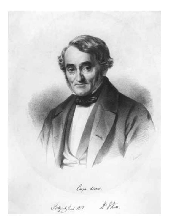
Figure 8. Carl Georg Theodor Kotschy. Lithograph by Engelbach.

traveled through the Orient (Turkey, Persia), where he collected much important material including types of later described species. Kotschy's connection to the Reiseverein was through the sponsoring of his second journey to Egypt and the Sudan (labeled "Aethiopia," which is the early name of the Sudan, Friis unpubl., from Nicolson, pers. comm.) in 1839. "Cordofan, Sennar, Faloskel" is found in Hochstetter and Steudel (1839). Herbarium is at W. For a concise biography, see Rechinger (1960); see also Stafleu and Cowan (1979c, 2:655), Chaudhri et al. (1972, 2(3):382).