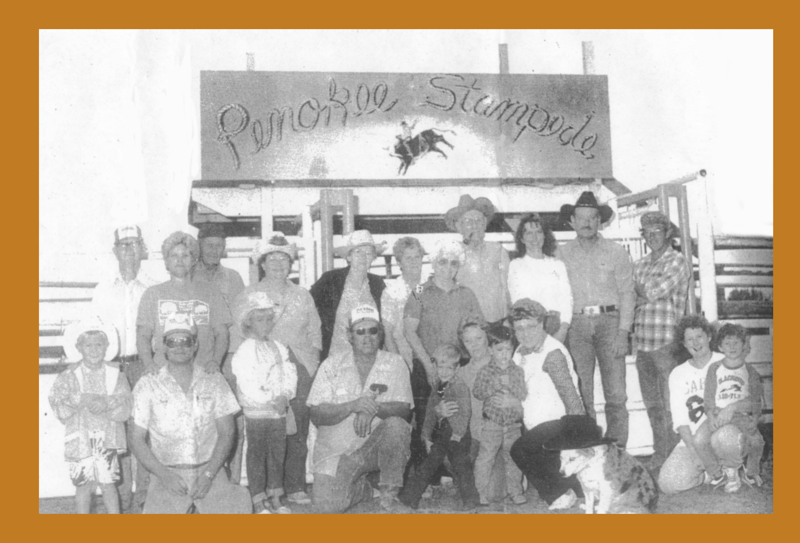
Many of the planners of Penokee's Centennial celebration that was held in September 1988.

The Penokee Methodist Church was the center of social events. It was home not only to Methodists, but all faiths of the community. It closed its doors in 1969. The schoolhouse has seen many children pass through and was a vital part of the community. The ball games, end-of-school-year potluck dinners, and comradeship came to a close in 1970. A red brick store building that was built in 1914 housed a grocery store with a soda fountain. It was closed to business in 1973. The Penokee Post Office in recent years has been not only a place to get mail, but a place to get caught up on the recent news, important notices, and to check up on your neighbor's well being.