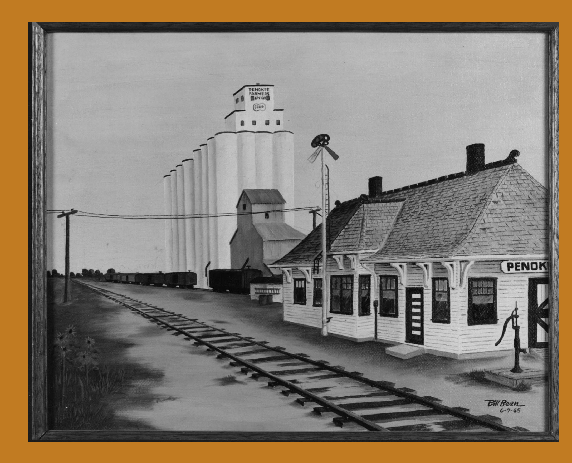
A 1965 painting by Bill Bean depicting the Penokee Railroad Depot.

The community is a melting pot of every nationality, every religion, and all are unique in their own special way. As a melting pot of people, Penokee has some wonderful cooks, that is the reason our potluck dinners are sooo good!!!!