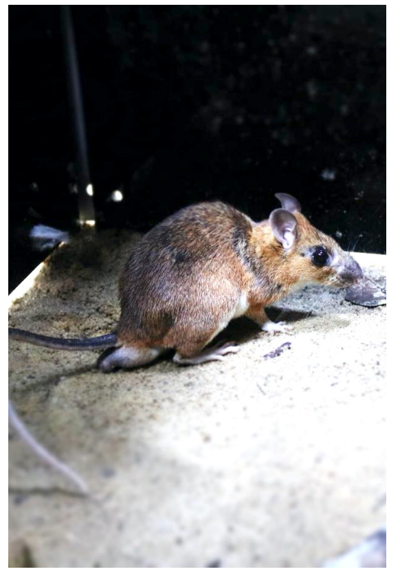
Figure 1.1: Brown Spiny Rat (Maxomys rajah)

sp., Hylopetes spp., and Petaurillus sp. are also dependent on fruits as their main food source. This is in contrast with large flying squirrels such as Petaurista spp., which prefer to eat leaves even though fruits are still part of their diet. From a study conducted in Merapoh, Pahang, Petaurista petaurista were seen eating fruit from Hairy Figs (Ficus hispida) and Ketapang (Terminalia catappa) (Miard et al., 2020). However, similar to the rat species under the Muridae family, the role of squirrels as seed dispersal agents is less clear because squirrels are also known to be seed predators. Even so, the nature of squirrels who love to collect and store fruit can contribute to seed dispersal when the fruit falls on the way to their nests (Lee et al., 2002).