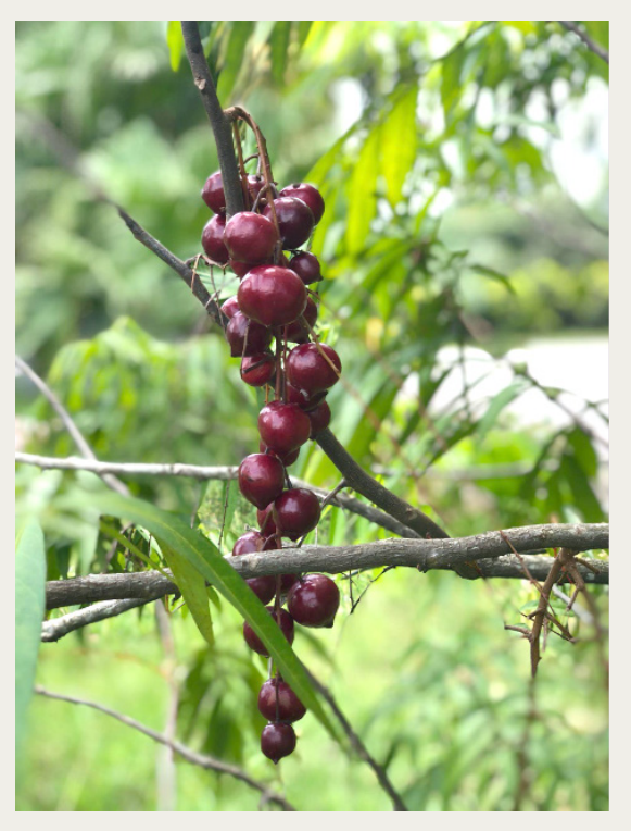
Figure 2.4: Terengganu Cherry (Lepisanthes alata)