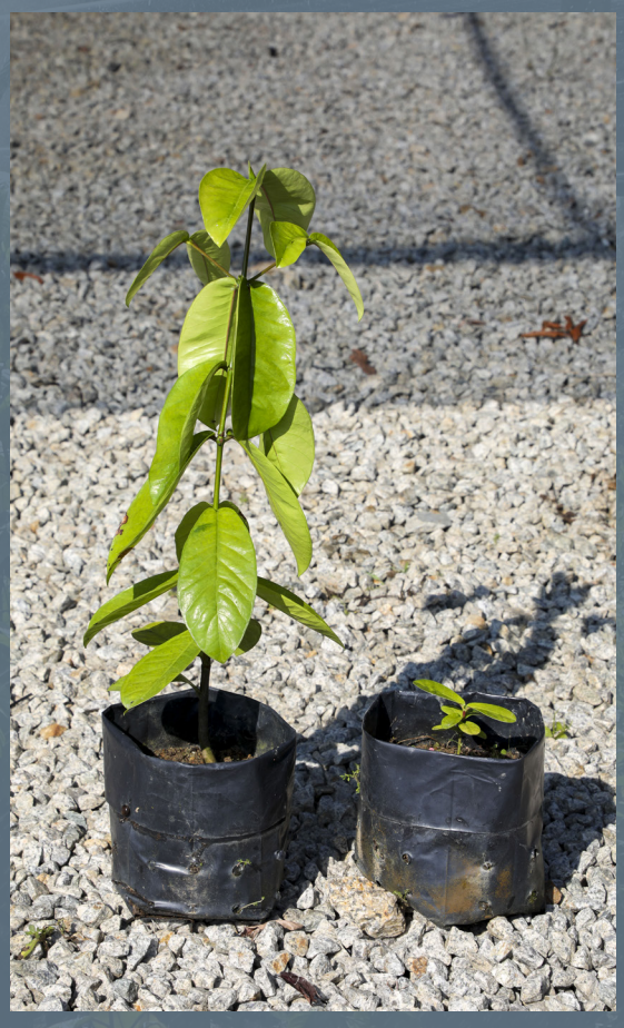
Figure 4.1 : Asam gelugor saplings at the early stage (right) and the final stage (left) of planting before being transplanted to the permanent plot

The previous section of this guideline describes the works involving saplings in nurseries. This chapter will describe the process of replanting in permanent plots, after the seedlings are successfully sown in the nursery. Seedlings from seeds, stem cuttings, shoot cuttings, air layering, and other breeding methods will be transferred to permanent plots when they are mature enough, and this period varies according to the plant species. Slow-growing trees such as asam gelugor ( Garcinia atroviridis ) can only be transplanted from the nursery to a permanent plot after 2 years. However, there are also tree species that are suitable for transplanting to permanent plots at the age of 8 months to a year. Figure 4.1 and 4.2 show the differences in terms of size for asam gelugor and durian saplings in the early stages of planting and the final stages before being transplanted to the permanent plots.