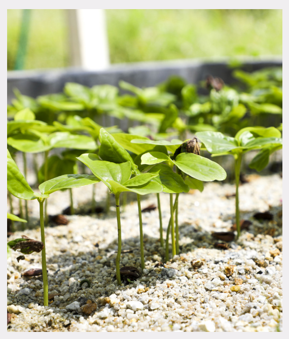
Figure 3.11: Plant material from seeds