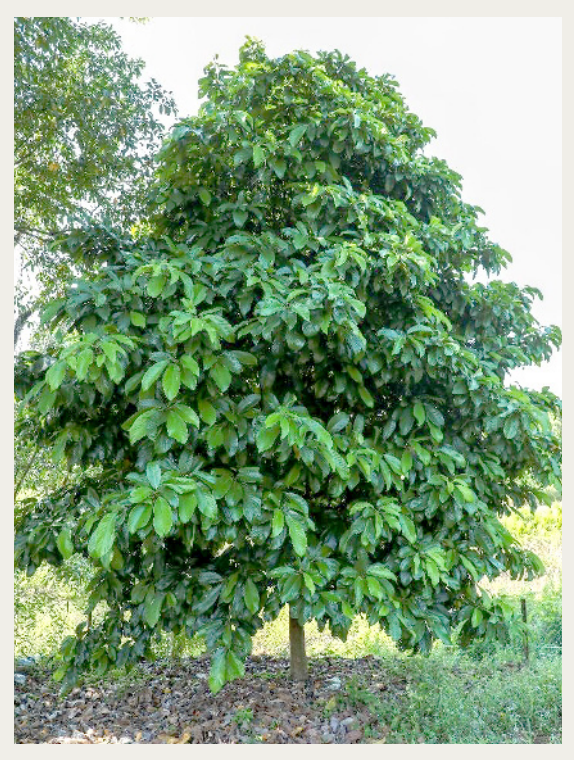
Figure 2.3: Rambai (Baccaurea motleyana)