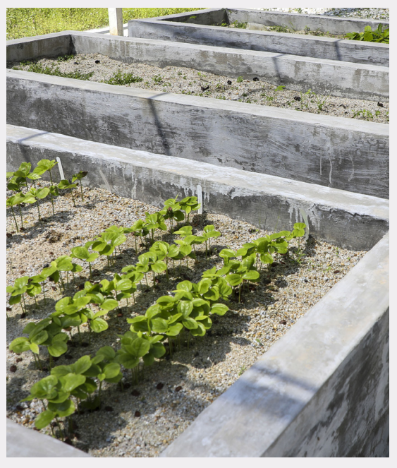
Figure 3.12: Seedling nursery where the seeds are sown