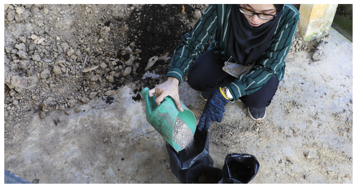
Figure 3.8: Filling the tube medium manually

Figure 3.7: Layers of soil and sand are put into the concrete mixer evenly before being sent to storage