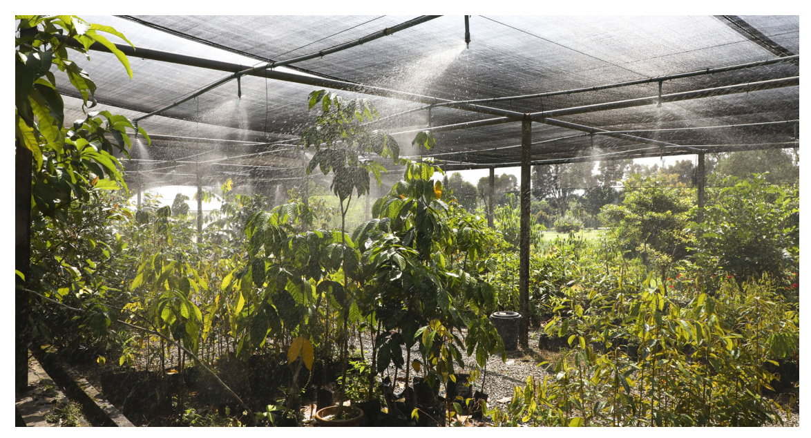
Figure 3.4: Automatic water sprinkler for watering plant

Nursery management activities involve works such as watering, fertilising, moisture control, and species naming. However, human resources and sapling management skills are often a problem. Thus, there is an important need for automated water management system to ensure the quality of rare seedlings sown ( Figure 3.4 ). A proper irrigation system will keep the soil moist and prevent the saplings from drying out and dying.