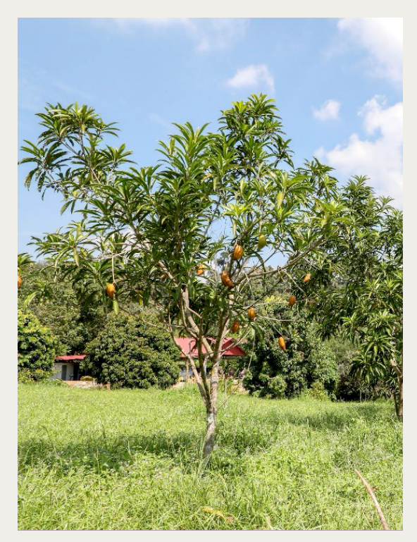
Figure 2.1: Canistel (Pouteria campechiana)