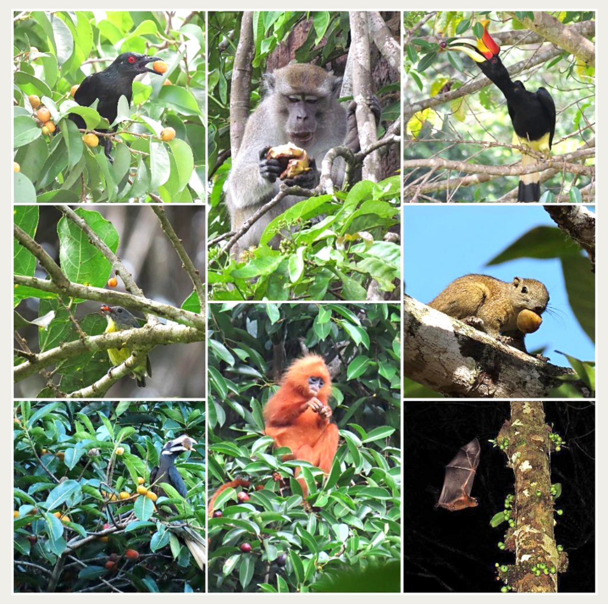
Figure 2.5: Frugivores that eats figs