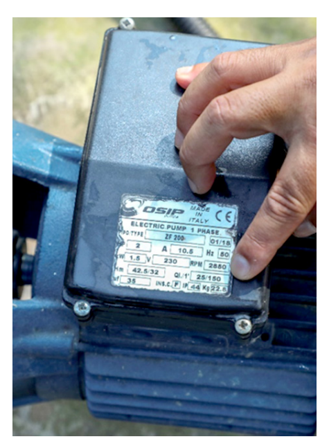
Figure 3.6: Electric pump used in nursery