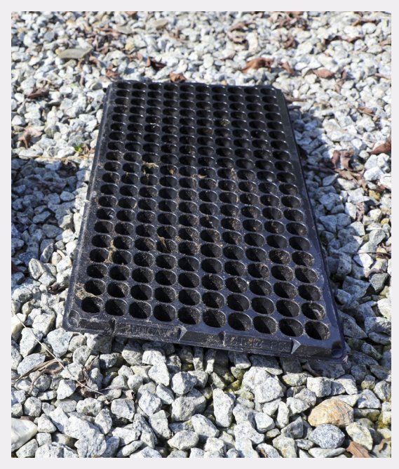
Figure 3.10 : Root trainer tubes with various cell numbers