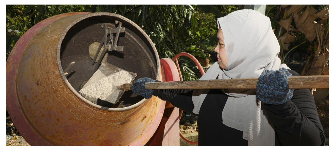
Figure 3.7: Layers of soil and sand are put into the concrete mixer evenly before being sent to storage