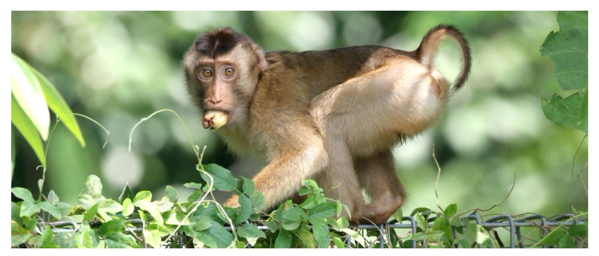
Figure 1.3: Pig-tailed macaque (Macaca nemestrina)