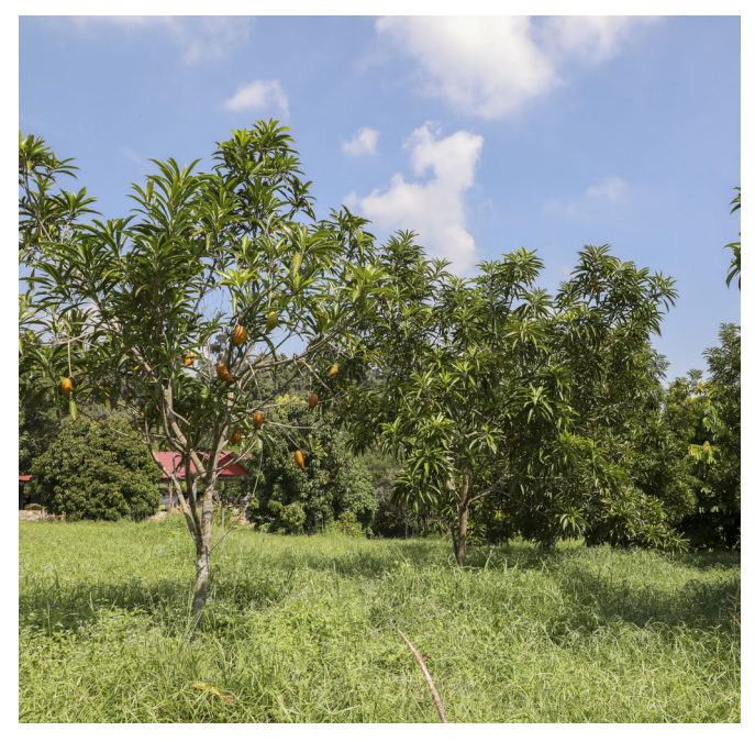
Figure 4.4 : Example of mixed crops for permanent plots consisting of various plant types such as mentega trees, mango trees, asam gelugor trees, and others

For large-scale permanent plots and challenging locations such as slopes, timber forest areas, and unproductive areas, watering is quite difficult. Therefore, it is very important to maintain soil moisture naturally by planting trees such as creeping legumes or shrubs such as Pintoi peanut (Arachis pintoi), Yellow dots (Sphagneticola trilobata), sambang getih/red ivy (Strobilanthes alternata), Japanese roses (Portulaca grandiflora), and little ruby (Alternanthera dentata). Planting grass or shrubs in advance before planting larger saplings helps to maintain the moisture of the soil and the area around the permanent plot. This method can prevent the soil from becoming dry due to sunlight exposure over a long period of time.