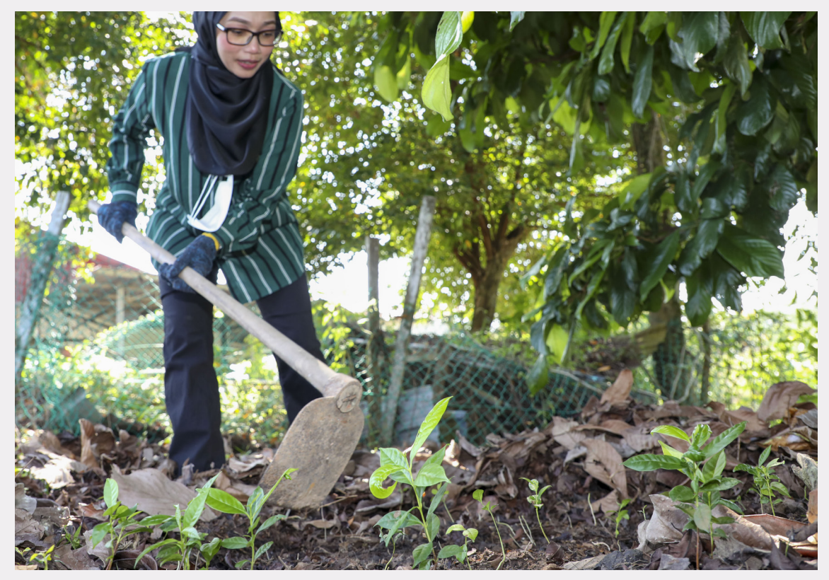
Figure 3.13: Collecting wild saplings that germinate naturally under the parent tree