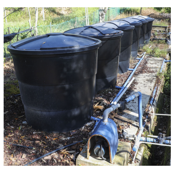
Figure 3.3: The source of clean water pumped into tanks

Clean water sources for nursery irrigation can be obtained from various means such as rivers, waterfalls, springs, lakes, and ponds that can be pumped into tanks ( Figure 3.3 ), and sprinkler systems can be used.