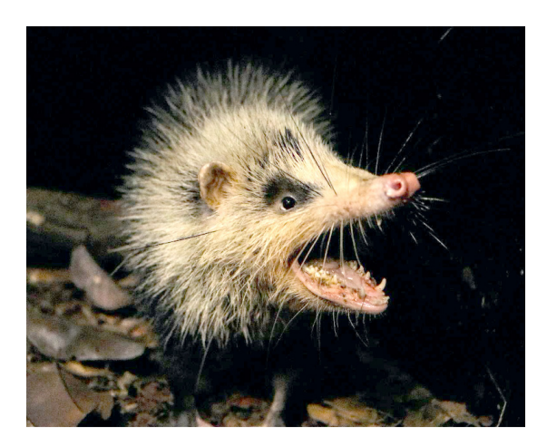
Figure 1.2 : Moonrat ( Echinosorex gymnura )

In Malaysia, the order Insectivora consists of 10 species of animals under three different families. In general, all members of the order Insectivora feed on insects. However, several studies have found that both species from the Erinaceidae family also feed on plants. Apart from captive Moonrats ( Echinosorex gymnura ) ( Figure 1.2 ), which have been observed eating a wide variety of fruits, wild moonrats have also been recorded feeding on plant parts such as oil palm seeds (Whittow et al., 1977). In addition, Hylomys suillus has also been observed to consume fruits in the wild (Chiozza, 2016).