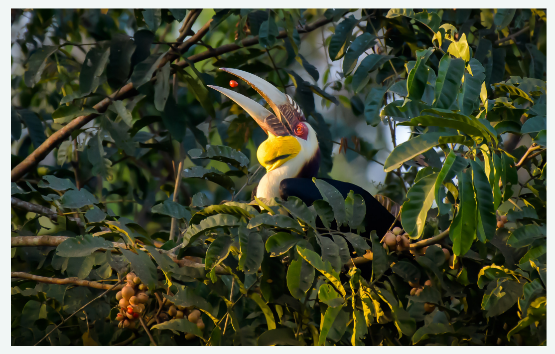
Photo: Wreathed Hornbill (Rhythiceros undulatus) eating wild fruit

This guideline is intended to be used as a reference in identifying the plants that serve as food for the wildlife in Malaysia. This guideline can also be used as a reference by the DWNP, FDPM, and any related agencies, especially in the reforestation and rehabilitation processes, as well as the management of nurseries to ensure the production of good quality seedlings of the food plants. Finally, the publication of this guideline can also contribute to the government's efforts in increasing food sources for the wildlife and their populations, which could eventually help in reducing conflict and wildlife deaths in Malaysia.