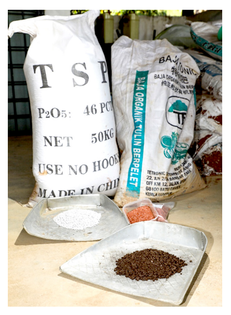
Figure 3.5 : Chemical and organic fertilisers used in nurseries