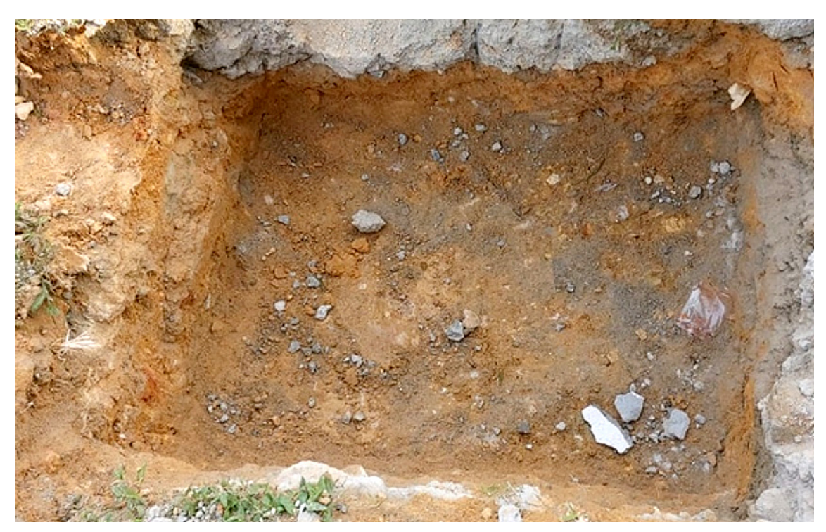
Figure 4.3: Example of a hole dug prior to seedling planting

help to increase the bacterial population in the soil in accordance with the increase in soil pH. The distribution of agricultural lime containing magnesium, calcium, and ferrous content is very suitable for treating high acidity soils such as peat soils. All of these treatments need to be applied to the holes dug for planting mature saplings ( Figure 4.3 ).