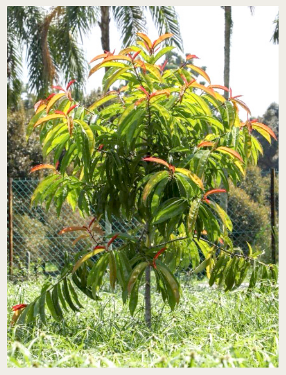
Figure 2.2: Asam Gelugor (Garcinia atroviridis)