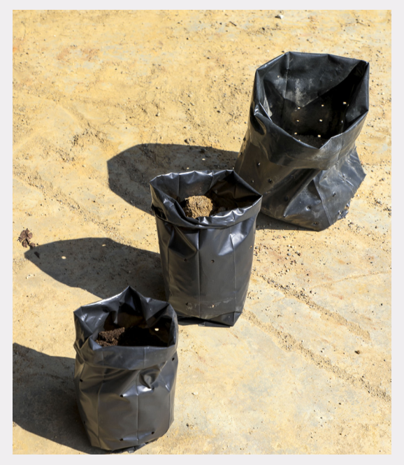
Figure 3.9: Black polybags of various sizes