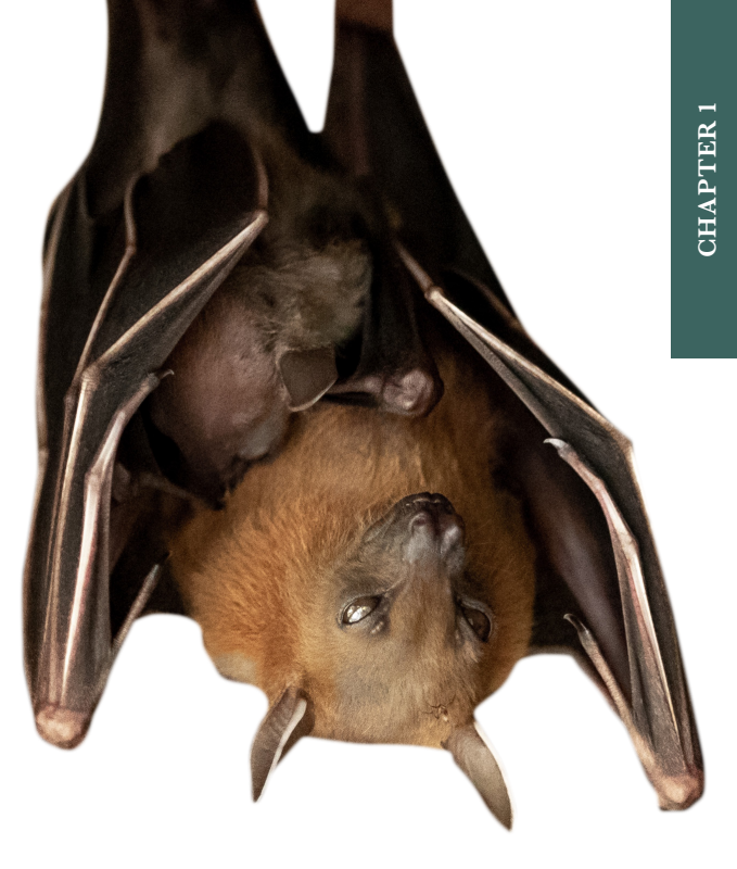
Photo: Lesser dog-faced fruit bat (cyneropterus brachyotis) with juvenile

Fruit bats are among the most important pollinators and seed dispersal agents in the ecosystems. Banana, petai , durian, and guava are some of the plant species that have been identified to be pollinated by bats (Kingston, 2006; Yazid et al., 2019). Among the bat species that play a significant role in pollination are nectar-eating bats of the genus Eonycteris sp. and Macroglossus spp. where a total of 32 pollen species have been identified as food sources for Eonycteris spelaea , Macroglossus minimus , and Macroglossus sobrinus (Start and Marshall, 1976).