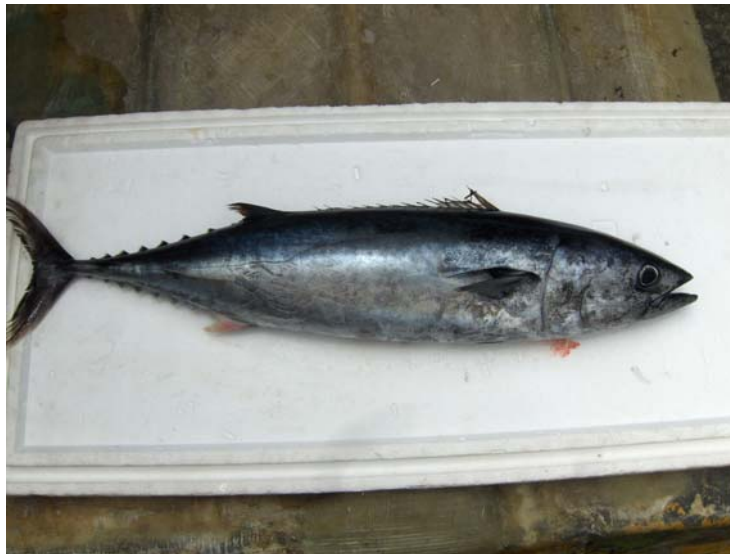
Figure 2. Specimen collected in Santos City, Brazil.