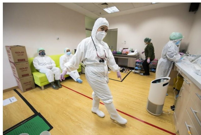
Health workers in Indonesia during the COVID-19 pandemic. Photo: ILO in Asia and the Pacific shared under a Creative Commons (BY-NC-ND) license

The pantry quickly became popular on social media. Inspired by the woman's resolve, Filipinos began sending donations from across the country and established over 400 copycat stalls.