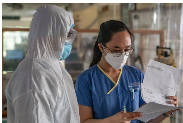
COVID-19: Philippines.

According to a government survey released in April, an estimated 6 out of 10 Filipinos experienced some form of food insecurity in the later part of last year.