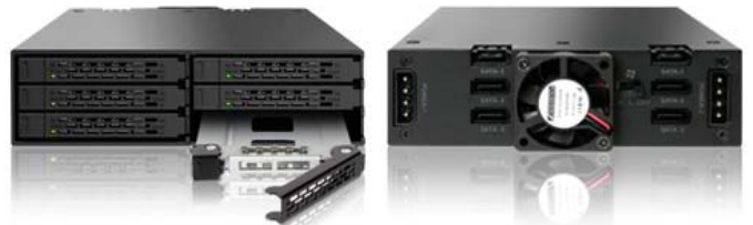
ICY DOCK ToughArmor MB996SP-6SB