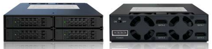
ICY DOCK ToughArmor MB994SP-4SB-1