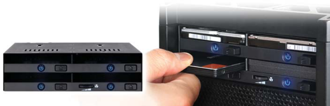
ICY DOCK flexiDOCK MB524SP-B