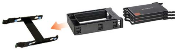
ICY DOCK EZ-Fit Trio MB610SP