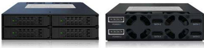
ICY DOCK ToughArmor MB994SP-4S