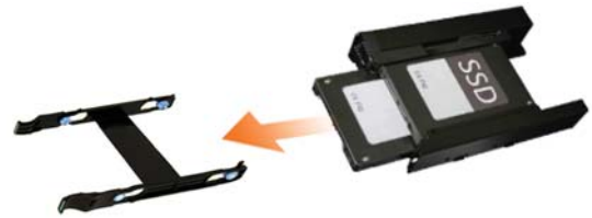
ICY DOCK EZ-Fit Pro MB082SP