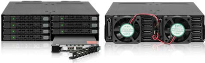
ICY DOCK ToughArmor MB998SP-B