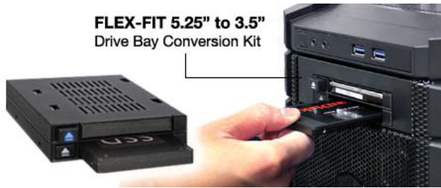
ICY DOCK FlexiDOCK MB521SP-B