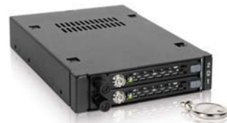
ICY DOCK ToughArmor EX MB492SKL-B