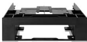
FLEX-FIT 5.25" to 3.5" Drive Bay Conversion Kit