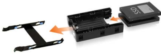
ICY DOCK EZ-Fit Lite MB290SP-B