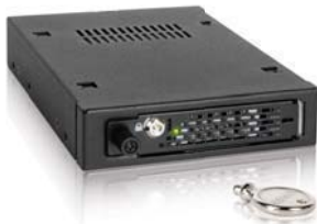
ICY DOCK ToughArmor EX MB491SKL-B