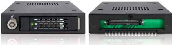
ICY DOCK ToughArmor MB601VK-B