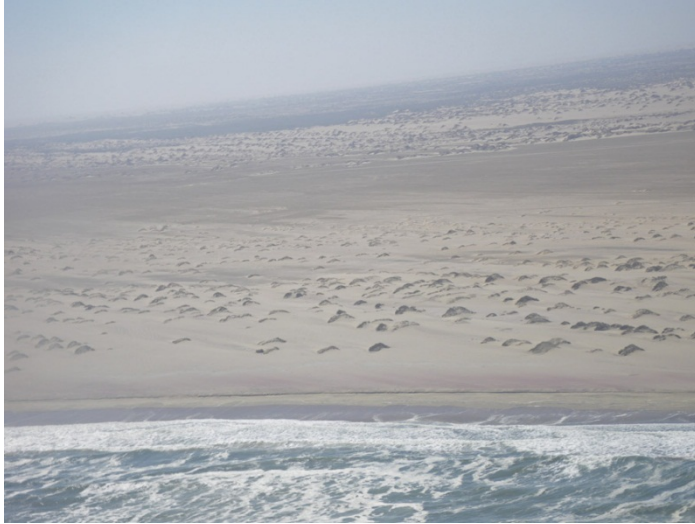
Low lying salsola embryo dunes backshore, Namib