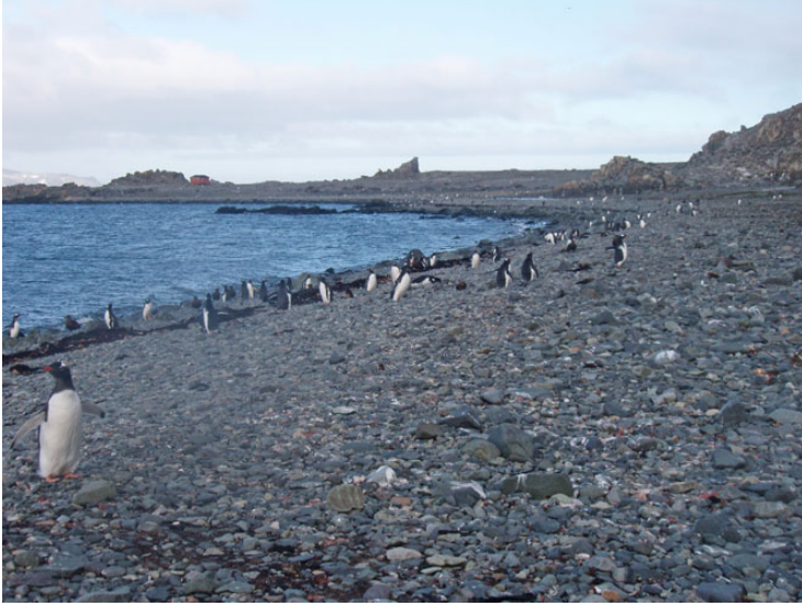
Gentoo penguin colony on shingle backshore

Ardley Island, Antarctica.