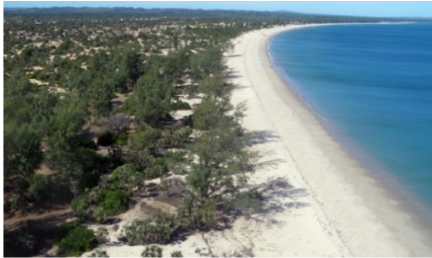
Anjavy Dry Forest meets Indian Ocean, Madagascar.

The backshore is that part or zone of a beach profile that extends landward from the sloping foreshore to a point of either vegetation development or a change of physiography, e.g. a sea cliff or a dune field.