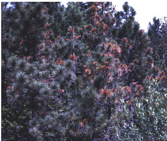
Figure 3. Branch "flagging" on ponderosa pine saplings.

Elytroderma disease in ponderosa pine can be easily recognized by several characteristics. Infected branches usually have noticeably-reddish needles in the spring and early summer. These infected branches are called flags because they stand out against a background of green foliage (Figure 3).