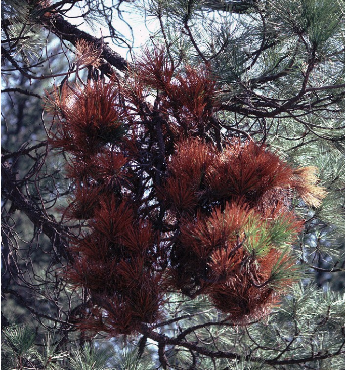
Figure 6. Brooms caused by Elytroderma disease.

Brooms also tend to be very dense, compact and round. Witches' brooms caused by Elytroderma disease are frequently mistaken for brooms caused by ponderosa pine dwarf mistletoe. Elytroderma brooms can be identified by the lack mistletoe shoots or basal cups and the accumulated dead needles and the upward curving branches. In addition, while the range of ponderosa pine dwarf mistletoe is limited to various areas along the western edge of Idaho; Elytroderma disease can be found across the range of ponderosa pine.