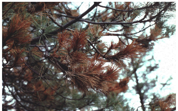
Figure 5. Brooms caused by Elytroderma disease.

A third character is the formation of witches' brooms. Witches' broom is a generic term for localized branch growth characterized by a proliferation of twigs with short internodes. In the case of Elytroderma disease, a witches' broom can begin to form several years after a branch is infected. Brooms caused by Elytroderma disease often have branches that curve upward at their ends and have many old, dead needles on them (Figures 5 and 6).