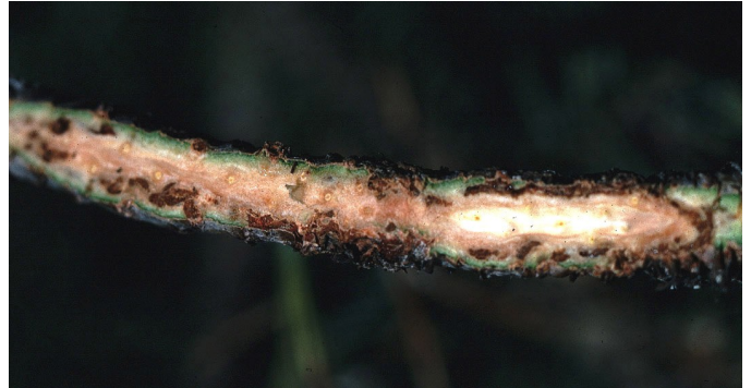
Figure 4. "Resin cysts" in the inner bark of an infected shoot.

A second character can usually be observed by making a shallow cut across an infected shoot to expose brown to black spots, called resin cysts (Figure 4).