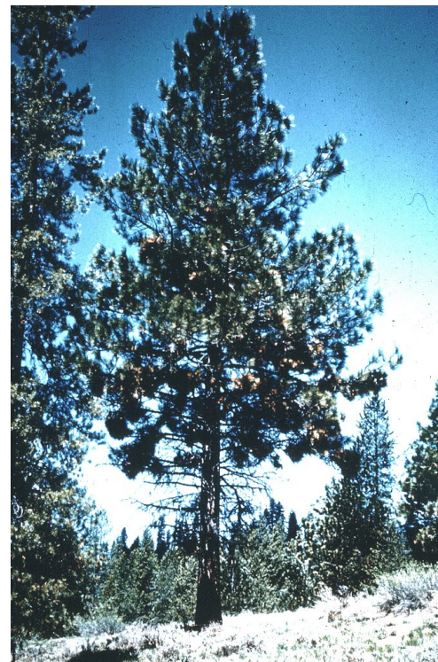
Figure 2. Brooming in the lower crown of a mature ponderosa pine.

Tom Schultz Director Idaho Department of Lands 300 N. 6th Street, Suite 103 Boise, ID 83720 Phone: (208) 334-0200