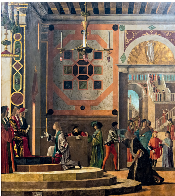
Vittore Carpaccio

Following the successful conclusion of the Treaty of Carlowitz in 1699, the Ottoman Empire increasingly sought and offered mediation during periods of conflict with and between its European enemies and allies. States