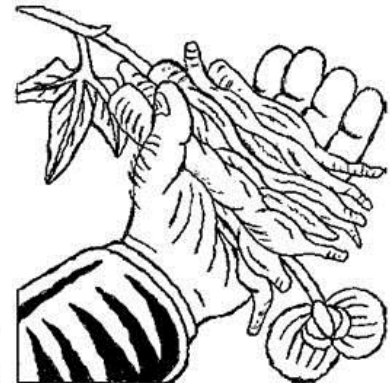
Figure 3. (continued) The second panel lists the names denoting Vigna lanceolata in the non-Pama-Nyungan languages; both panels include (second panel, middle row, first from left) the genuine photograph portrait of the most famous Australian Aboriginal artist, Emily Kame Kngwarreye, (first panel, middle row, first from left) the photograph of Ms. Kngwarreye creating in the field and (first panel, top row, third from left) her painting Yam Dreaming