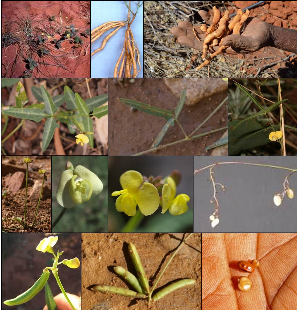
Figure 1. Some morphological features of Vigna lanceolata : (from left to right and from top to bottom) creeping or trailing growth habit typical for isolated plants; tap root and rhizomes; harvested rhizomes; broad leaflets; medium-width leaflets; narrow leaflets; long and upright peduncles; less intense coloured aerial flowers; more intense coloured aerial flowers; colourless amphicarpic flowers; an immature aerial pod; aerial pods assembled in an infructescence; aerial seeds

The genus Vigna is represented in the flora of Australia with five species, namely V. lanceolata , V. luteola , V. marina , V. radiata (L.) R. Wilczek and V. vexillata (L.) A. Rich. (Lawn & Watkinson, 2002), of which the first one is endemic solely to Australia. The Global Biodiversity Information Facility (GBIF) treasures precious, thorough and updating information about the ecogeography of V. lanceolata . This species is present in the wild floras of all the states and territories of the Commonwealth of Australia, except the Australian Capital Territory and Tasmania (Fig. 2). Of the total number of 1811 catalogued accessions of V. lanceolata in GBIF, almost 91%, that is, 1646, come from the Northern Territory, followed by 83 from Western Australia, 52 from New South Wales, 13 from Queensland, 10 from South Australia and one from Victoria. The single remaining accession in the GBIF database is the only one outside of