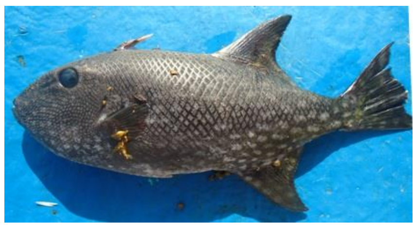
Fig. 4. Canthidermis maculata collected by tuna gillnet from offshore waters on February 12, 2013.

Canthidermis maculata (rough triggerfish) was reported from Pakistan by Psomadakis et al. (2015) and Moazzam et al. (2016). It was previously reported by Sorley (1932) from Sindh coast as Balistes maculatus. Specimens collected from Pakistan agree with the description for the species given by Randall (1995). Dorsal and anal fins especially in adults are high giving them a streamlined 'double keel' appearance whereas caudal fin is double concave (rounded in juveniles). Its colour varies from blue grey to nearly black with slightly lighter on belly and sides. Body is usually covered with small horizontally elongated white spots extending onto dorsal and anal fins and often on tails as well. In older specimens the spots may disappear.