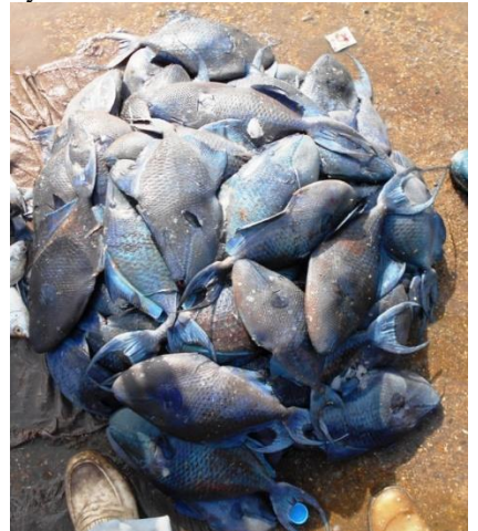
Fig. 13. Commercial landings of Odonus niger at Karachi Fish Harbour (March 7, 2016).

Unusual increase in landings of unicorn leather jacket ( Aluterus monoceros ) belonging to family Monacanthidae was noticed in Pakistan (Moazzam and Osmany, 2016) In India, also A. monoceros appearing in commercial catches in 2004 (Chavan et al. , 2004; Ghosh et al. , 2011; Kanthan et al. , 2011, Saleela et al. , 2011; Varghese et al. , 2011). Increase in landings of Canthidermis maculata and Odonus niger is may be attributed to similar increase in landings of Aluterus monoceros . The reason of such increase in the species of families Monacanthidae and Balistidae is not fully understood.