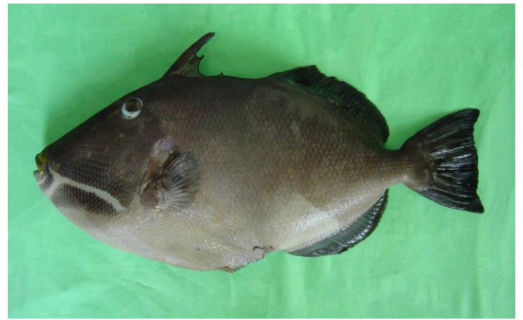
Fig. 10. Sufflamen fraenatum.

Fish Harbour on July 12, 2013 (30 cm), Churna Island by a sport fishermen on February 13, 2017 (27 cm) and Astola Island on December 24, 2019 (24 cm) were examined.