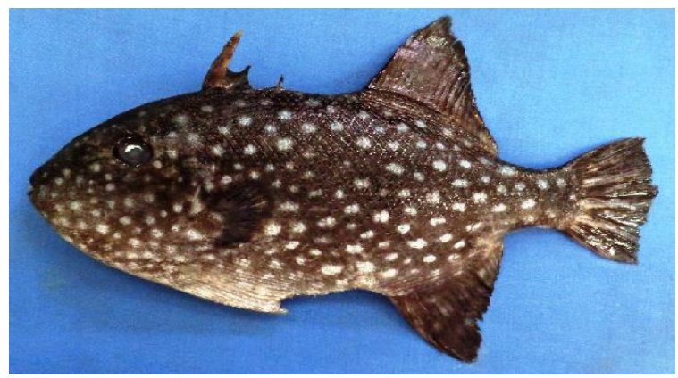
Fig. 5. Canthidermis maculata Juvenile (21 cm) landed at Karachi Fish Harbour on January 6, 2016.

Scales in juveniles of C. maculata have short fleshy outgrowths or lack them and pale spots are either absent or very small and do not form any network pattern. Juveniles (between 4 and 6 cm) were observed on a number of occasion in the offshore associated with neuston and floating debris, however, because of difficulty in collection, these could not be photographed.