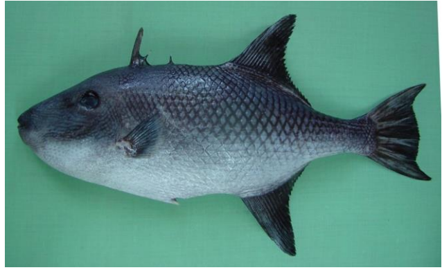
Fig. 3. Canthidermis marolepis collected by tuna gillnet from offshore waters.

Canthidermis macrolepis (large-scale triggerfish) was reported from Pakistan by Psomadakis et al. (2015) and Moazzam et al. (2016). Specimens collected from Pakistan agree with the description for the species given by Gill and Randall (1997). Juveniles of C. macrolepis can be readily distinguished from scale morphology and coloration (Gill and Randall, 1997). Scales in juveniles of C. macrolepis are relatively long, branched and with fleshy outgrowths present on body and head scales.