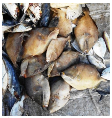
Fig. 14. Commercial landings of Sufflamen fraenatum at Karachi Fish Harbour (November 13, 2018).