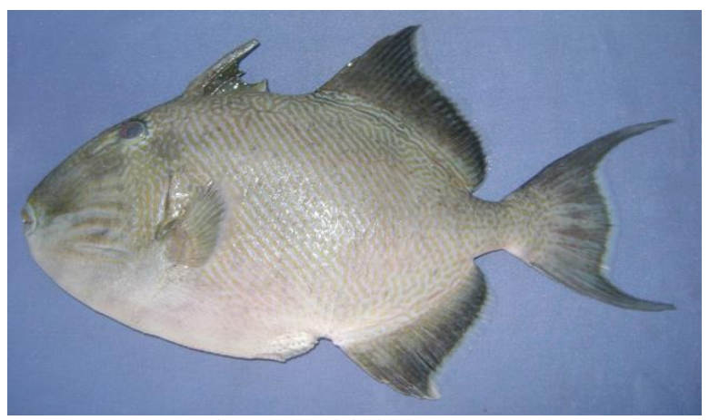
Fig. 7. Pseudobalistes fuscus.

two specimens collected from off Balochistan on January 24, 2011 (41 cm) and Karachi Fish Harbour on April 8, 2014 (47 cm) were examined.