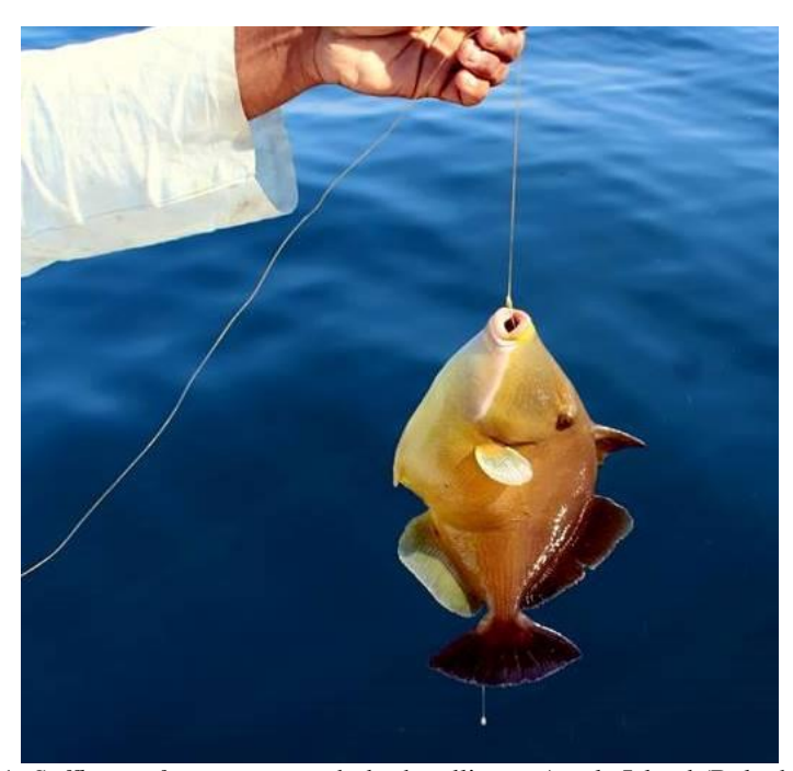
Fig. 11. Sufflamen fraenatum caught by handline at Astola Island (Balochistan).