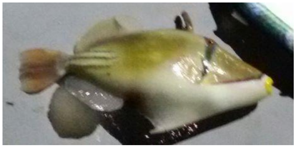
Fig. 8. Rhinecanthus assasi collected from Jiwani.