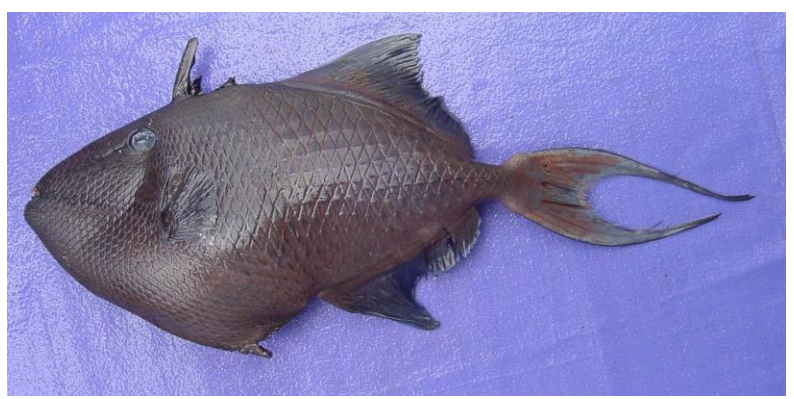
Fig. 6. Odonus niger.

Odonus niger (red-toothed triggerfish) was reported from Pakistan coast only by Psomadakis et al. (2015). Rüppell (1836) originally described as Xenodon (Balistes) niger from Jeddah, Saudi Arabia, Red Sea. No holotype is known, however, lectotype (SMF 5232) is housed in Forshungs Institut und Natur Museum Senckenberg, Frankfurt, Germany (Frickle et al., 2022). Randall (2005) described the red-toothed triggerfish as having a moderately and deeply compressed blue to purplish-blue body with the eyes high on the head. There is a deep groove in front of the eye. Two dark blue lines run from the front of the eye to the upturned mouth. In adults, the teeth are red and chisellike with two of the upper teeth visible even when the mouth is closed. Triggerfish have a first dorsal fin with a spike-like spine that can be locked into place by the smaller second and third dorsal spines, all of which fit into a groove when not upright. The caudal fin is lunate with long lobes. The skin is rough to the touch with non-overlapping scales.