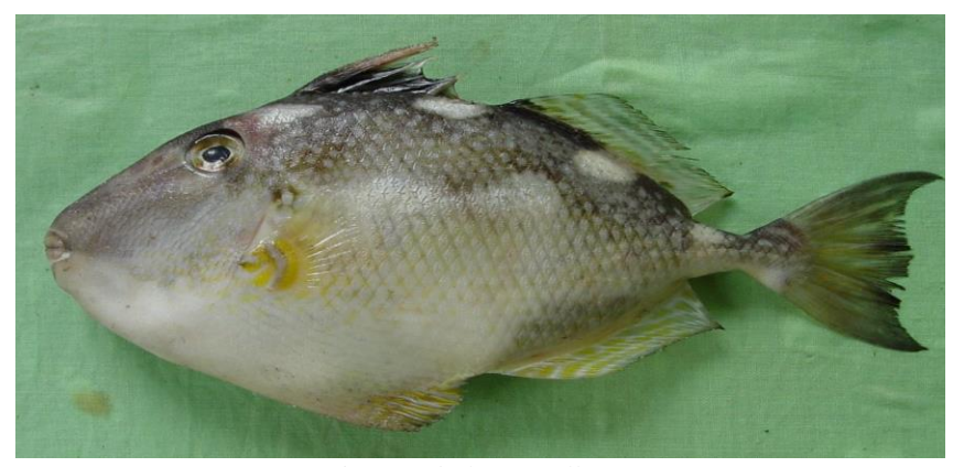
Fig. 2. Abalistes stellatus.

From Pakistan, Abalistes stellatus (starry triggerfish) was recorded by Bianchi (1985), Froese and Pauly (2022), Hoda (1985, 1988). Hutchins (1984), Misra (1962), Psomadakis et al. (2015), Siddiqui and Aamir (2010) and Sorley (1932). Hutchins (1984), Misra (1962), Hussain (2003) also reported this species from Pakistan as Abalistes stellaris