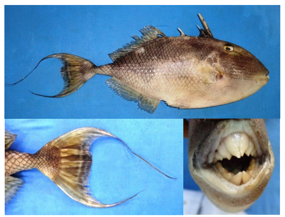
Fig. 1. Abalistes filamentosus (a) lateral view; (b) tail showing filaments; (c) jaws with teeth.

b). Its teeth are incisiform which are notched on edges (Fig. 1c). A. filamentosus differs from A. stellatus in having filamentous caudal-fin rays, 3–4 longitudinal grooves on the cheek, and the body without colourful markings.