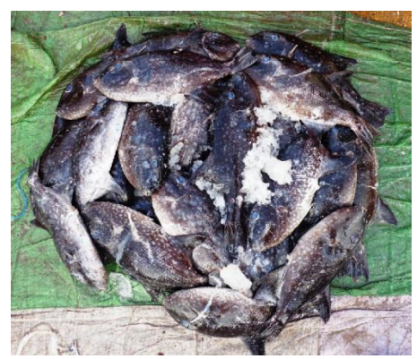
Fig. 12. Commercial landings of Canthidermis maculata at Karachi Fish Harbour (October 22, 2015).

Unusual increase in landings of unicorn leather jacket ( Aluterus monoceros ) belonging to family Monacanthidae was noticed in Pakistan (Moazzam and Osmany, 2016) In India, also A. monoceros appearing in commercial catches in 2004 (Chavan et al. , 2004; Ghosh et al. , 2011; Kanthan et al. , 2011, Saleela et al. , 2011; Varghese et al. , 2011). Increase in landings of Canthidermis maculata and Odonus niger is may be attributed to similar increase in landings of Aluterus monoceros . The reason of such increase in the species of families Monacanthidae and Balistidae is not fully understood.