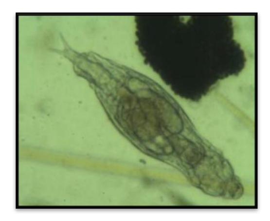
Fig.2 Photograph the infected gills of Catla catla .