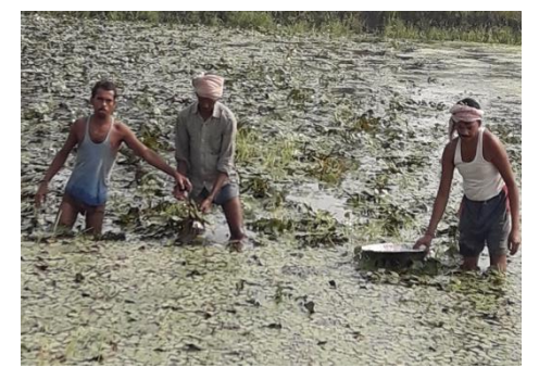
Fig.2 Harvesting of water chestnut

Traditionally water chestnut is consumed after boiling. This is high value nut from which sweets and precious chapatti may be made. Sun drying or artificial drying in oven is common in India. It's a medium to low calorie food with maximum nutrients which is gaining importance for making snacks for every class of people throughout the world. Nut is free from gluten and cholesterol and rich in K, Mg and fiber, which renders it an ideal snack. Low cost mixed food can be made by mixing this nut flour with wheat and pulse flour to fortify its nutritional value (Sha et al. , 2016; and Baba et al. , 2016).