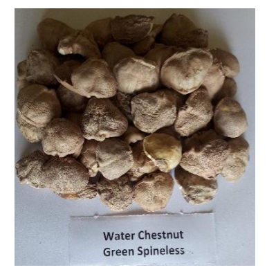
Fig.4 Green Spineless dry nut

health conscious people. Water chestnut crop can significantly improve the livelihood of farmers living in water surplus regions of rural India if cultivated with right agronomic techniques and processed appropriately after harvest.