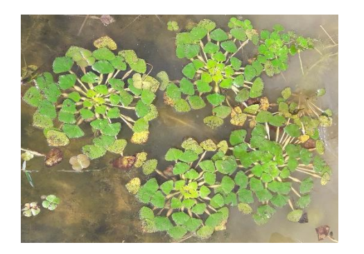
Fig.1 Water chestnut plant

Spineless Red cultivar flowers first at wetland ecosystem of North Bihar during 2<sup>nd</sup> week of August. Blooming period continues to 1<sup>st</sup> week of September. But Spineless Green cultivar has longer blooming period from August to October. Harvesting of the nuts is usually performed during October to December (Fig. 2). A well maintained local genotype gives the maximum yield of 2.5-3.5 t/ha (Jana, 2016). Bihar Large Red (Spine), the commercial variety of Mithila region, Darbhanga, India, gives a higher vield of 7.0 t/ha (Jana et al., 2019). The maximum yield of 12.0 t/ha can be achieved by cultivation of Green Spineless genotype (Jana et al., 2019). Regular eradication of aquatic weeds, especially Hydrilla and Sagittaria, common in makhana and water chestnut crop, is utmost important during the cropping season to avoid the crop-weed competition (Jana, 2016b)