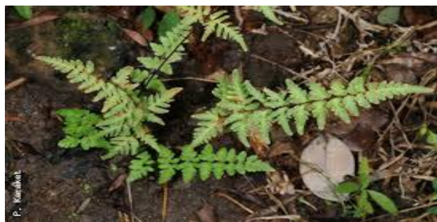
Figure2.1. Study plant: Aleuritopteris bicolor

The material for the present study comprised of whole plant of fern, Aleuritopteris bicolor belongs to the family Sinopteridaceae. It grows on undisturbed moist and shady areas in Dehradun.