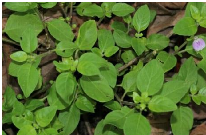
Figure 1: Justicia tranquebariensis

Kingdom : plantae Division : magnoliophyta Class : magnoliopsida Order : scrophulariales Family : acanthaceae Subfamily : acanthoideae Genus : Justicia Species : tranquebariensis