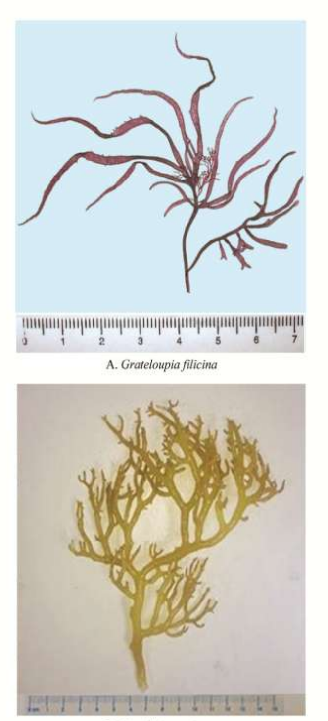
B. Gracilaria corticata

E-ISSN: 2582-2160 • Website: www.ijfmr.com • Email: editor@ijfmr.com