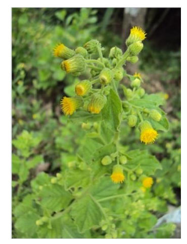
Figure 1. Blumea lacera

E-ISSN: 2582-2160 • Website: <u>www.ijfmr.com</u> • Email: editor@ijfmr.com