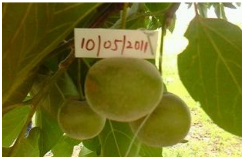
Slide 6: Female plant of Trewia nudiflora showing mature fruits with colour initiation as on May 05, 2011 in the campus of Forest Research Institute, Dehradun