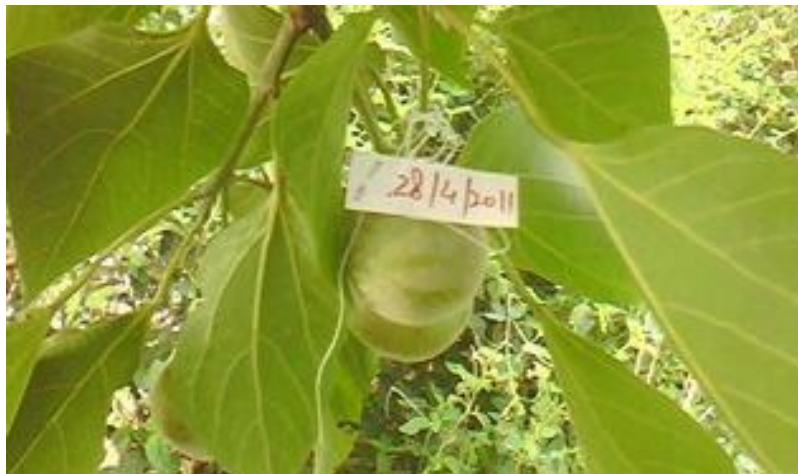
Slide 5: Female plant of Trewia nudiflora showing mature green fruits as on April 28, 2011 in the campus of Forest Research Institute, Dehradun