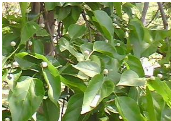
Slide 3: Female plant of Trewia nudiflora showing inflorescence of female flowers on March 28, 2011 in the campus of Forest Research Institute, Dehradun