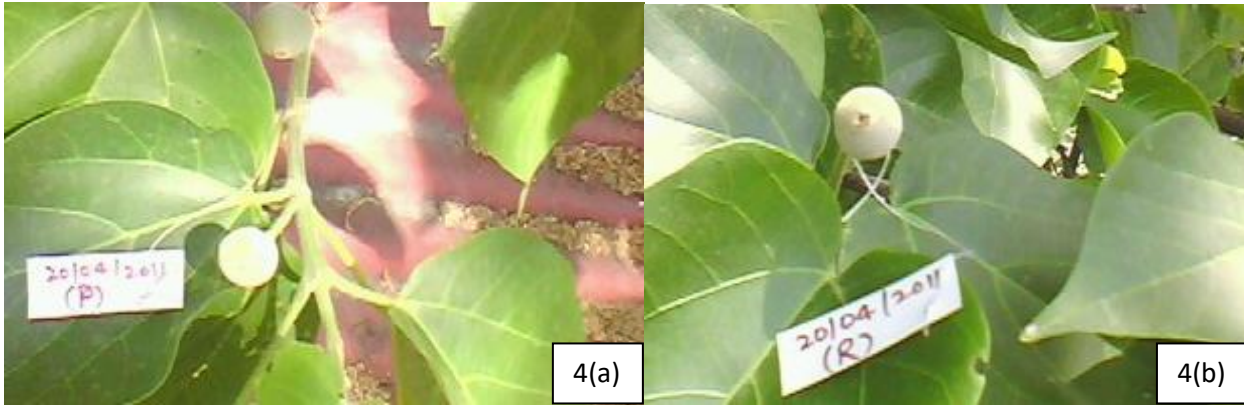
Slide 4(a) and 4(b): Female plant of Trewia nudiflora showing immature green fruits as on April 20, 2011 in the campus of Forest Research Institute, Dehradun