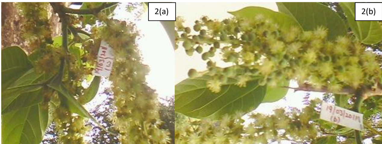
Slide 2(a) and 2(b): Male plant of Trewia nudiflora showing inflorescence of male flowers on March 19, 2011 in the campus of Forest Research Institute, Dehradun