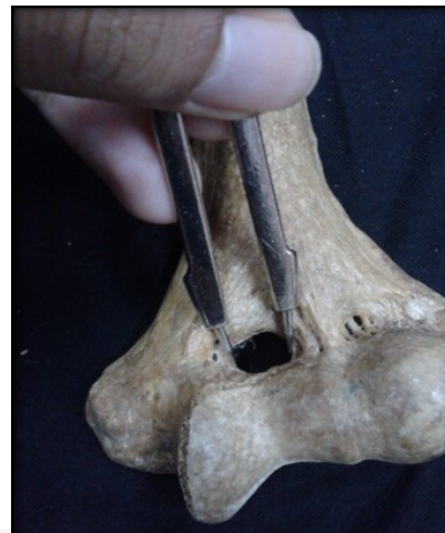
Fig. 1: Measurement of transverse diameter of STF with double tipped compass.

Out of the 132 bones studied, 34 (25.76%) bones showed the presence of supratrochlear foramen. The incidence was observed to be more on the left side than on the right side. Out of 72 left sided humeri, 21 (29.17 %) were bearing supra-trochlear foramen and out of 60 right sided humeri 13 (21.6%) were bearing supratrochlear foramen. The different shapes of supratrochlear foramen observed were Oval, round, bilobed and irregular (Figure 2, 3, 4 and 5). The most common shape observed was oval in 19.69%, round in 3.03%, bilobed shape in 1.51% and irregular in 1.51% of the specimens (Figure 6). The incidence of the shapes of supratrochlear foramen was tabulated in Table 1.