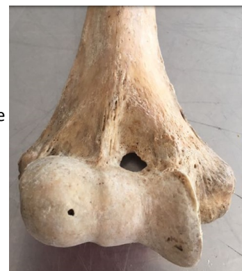
Fig. 2: Showing the oval shaped supratrochlear foramen.