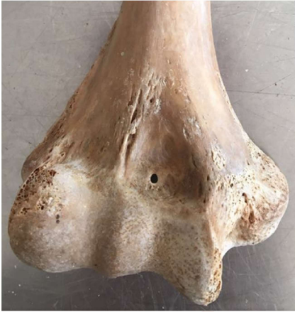
Fig. 4: Showing the irregular shaped supratrochlear foramen.