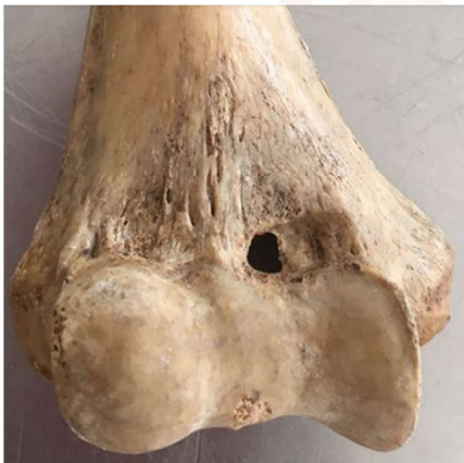
Fig. 5: Showing the bilobed supratrochlear foramen.