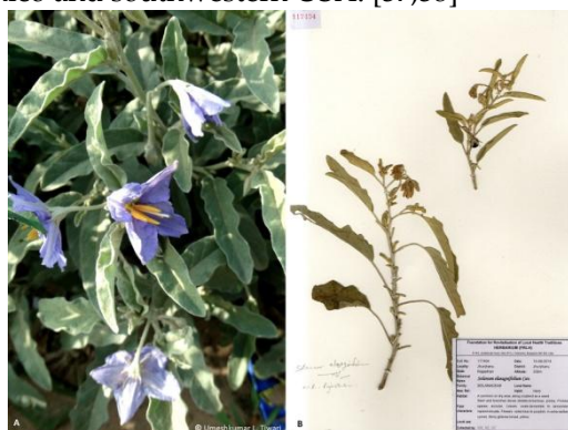
Image 3. Solanum elaeagnifolium Cav. A - Habit with flowers; B - Voucher specimen

Note: Solanum , a member of family Solaneaceae, is a large and diverse genus of annual and perennial plants containing nearly 2000 species of which 37 are native to Asia. In India Genus Solanum is represented by 45 species. Solanum elaeagnifolium is native to northeastern Mexico and southwestern USA. [37,38]