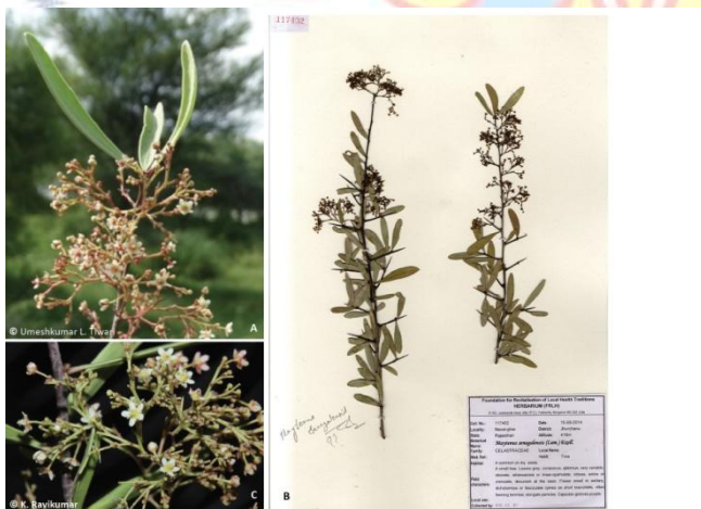
Image 3. Maytenus senegalensis (Lam.) Exell. A - Inflorescence stalk with leaves; B - Voucher specimen; C - Close up of flowers.

Specimen examined: 117402 (FRLH!), 15.viii.2014, Rajasthan- Naval-ghar, Jhunjunu 27°26'0.4"N & 075°14'0.5"E, 418m, coll. K. Ravikumar, N. Balachandran and Umeshkumar Tiwari. Flowering: August; Fruiting: October. Distribution: Tropical and subtropical Africa and Asia. Note: In India Genus Maytenus is represented by 18 species. This is very common in dryer areas.[30]