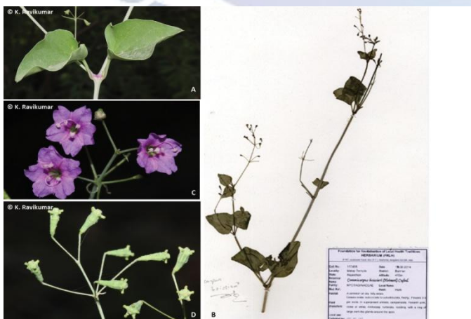
Image 1. Commicarpus boissieri (Heimerl) Cufod. A - Leaf; B - Voucher specimen; C - Flowers; D - Fruits

Note: This species has been reported from western Panjab, Konkan, Sindh, Gujarat, Mysore and Hyderabad, Travancore and Carnatic (Hooker 1885). In Rajasthan this species was observed to be common in and around Shri Jogi Mataji Temple, Barmer under the shade of Prosopis juliflora (Sw.) DC. forest. Commicarpus boissieri (Heimerl) Cufod. is closely related to Commicarpus verticillatus (Poir.) Standl. (syn. Boerhavia verticillata Poir.), from which it differs in the flowers that are 5–7 mm long in verticils of 4–7; stamens rarely more than 3.[23,24]