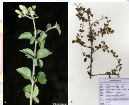
Image 4. Premna resinosa (Hochst.) Schauer subsp. resinosa A - Inflorescence stalk with leaves; B - Voucher specimen

Note: In India Genus Premna is represented by 31 species .