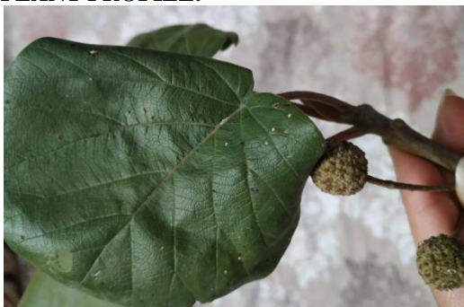
Figure No.1: Leaf with seeds.