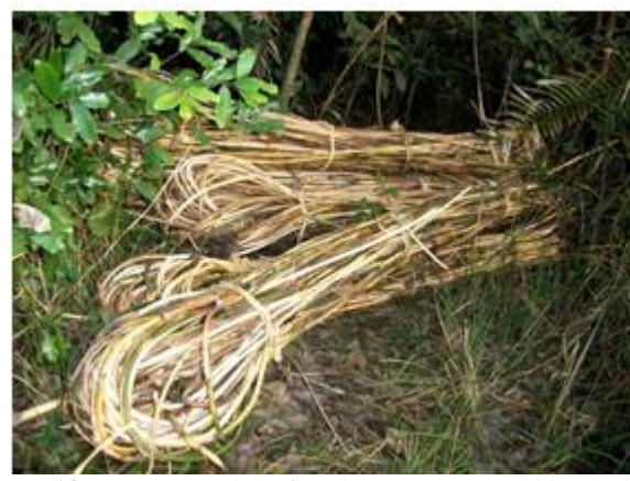
Figure 12: Raw material of Calamus tenuis sold in the local market