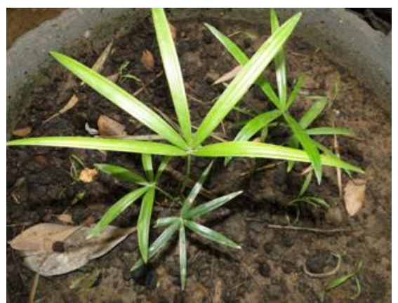
Figure 5: One month seedlings stage of Calamus tenuis after germination