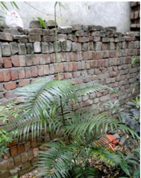
Figure 9: View of calamus tenuis growth status April 2015.

Volume 4 Issue 5, May 2015 www.ijsr.net Licensed Under Creative Commons Attribution CC BY