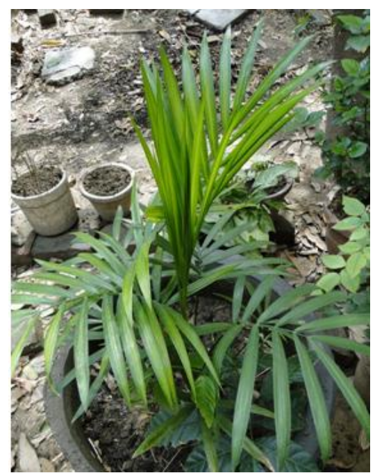
Figure 6: Six months old saplings of calamus tenuis .