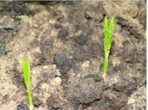
Figure 3: Seedlings of Calamus tenuis