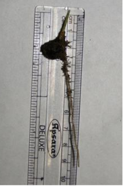
Figure 4: View of Plumule and radical of calamus tenuis