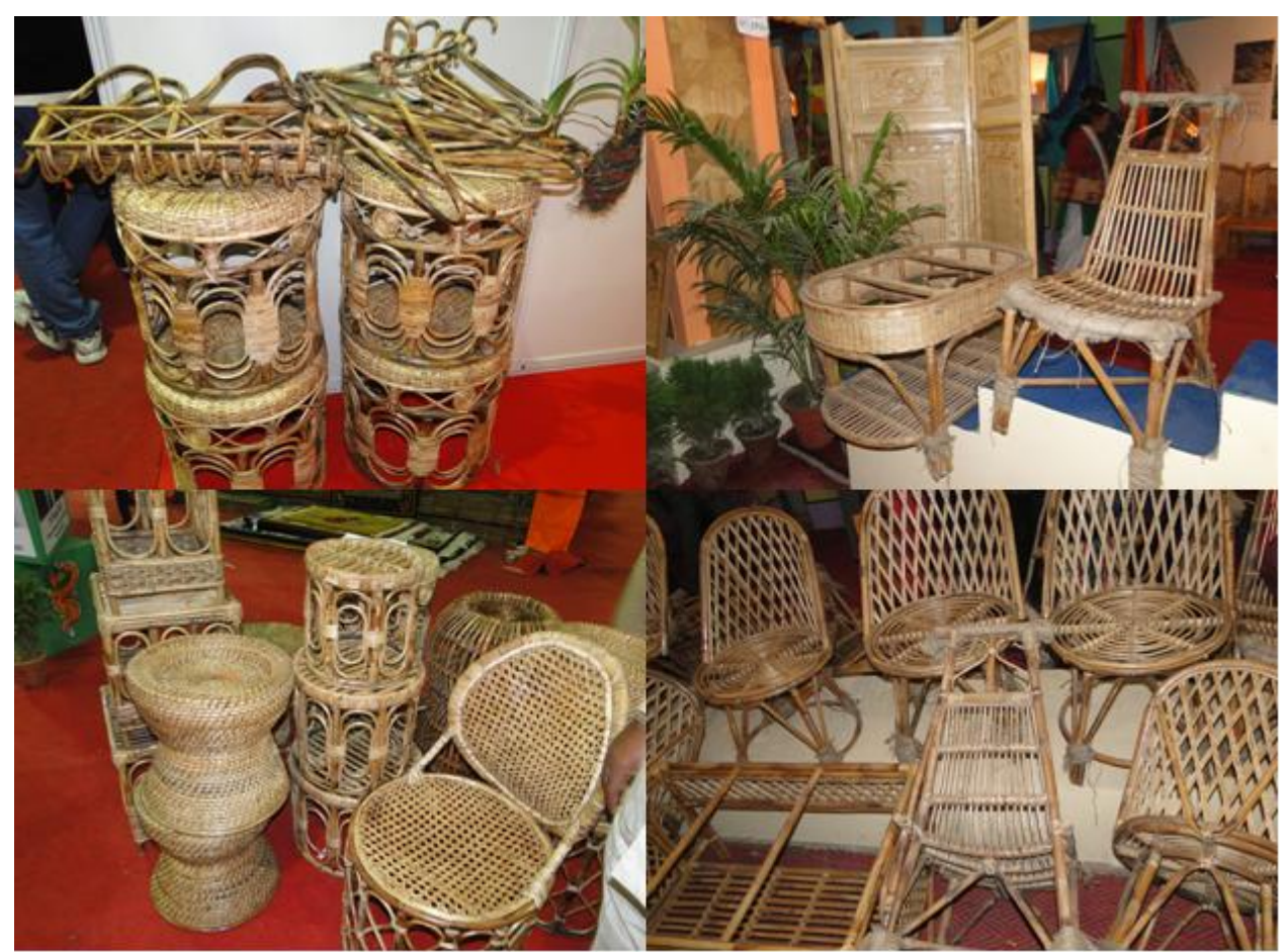
Figure 13: View of various beautiful and strong products made by Calamus tenuis