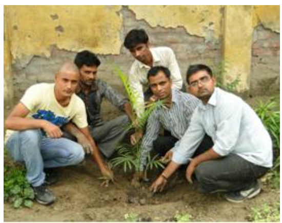
Figure 7: Six month old sapling transplanted at Sanjay van Delhi road.