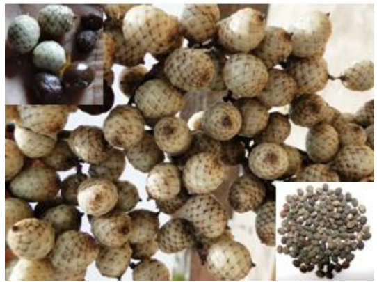
Figure 2: View of mature fruit, brown colour pulp and removing seed coat seeds