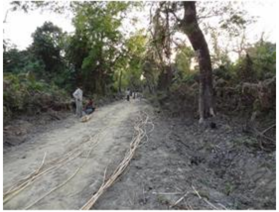
Figure 10: View Length, stem of Calamus tenuis taken pic. Place katarniaghat forest area.