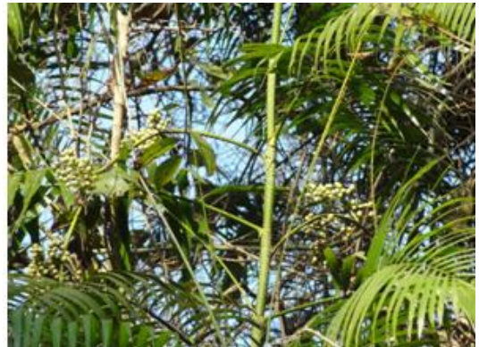
Figure 1: Community of Calamus tenuis in Katarniaghat forest areas.