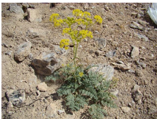
Figure 1: General view of Ferula kyzylkumica

annual period of growth and development and a long rest period attributable to unfavorable time of the year. According to the features of a large passage of the life cycle of the genus of Ferula monocarpic and polycarpic. Monocarpic bloom once in the end of his life, and after fruiting they die completely. In polycarpic species of Ferula life cycle does not end after the first flowering and fruiting. The object of the research is Ferula kyzylkumica - rare endemic remnant low mountains and variegated Kyzylkum (Tamdytau, Beltau, Sangruntau, Bukantau, Kulzhuktau, Auminzatau), listed in the Red Book of the Republic of Uzbekistan [20]. Herbaceous perennials, polycarpic, ephemeroïd (Fig.1). Stem solitary, up to 70 cm high, the base of the fibers enveloped dead basal leaves. Branches alternate. The record sheet in outline widely rhombic, trifoliate dissected. Stem leaves with strongly reduced plate, swollen vagina. Fruits are oblong-oval, pubescent few short hairs. Reproduction seed, blooms in May, fruiting in June. I eat all kinds of cattle.