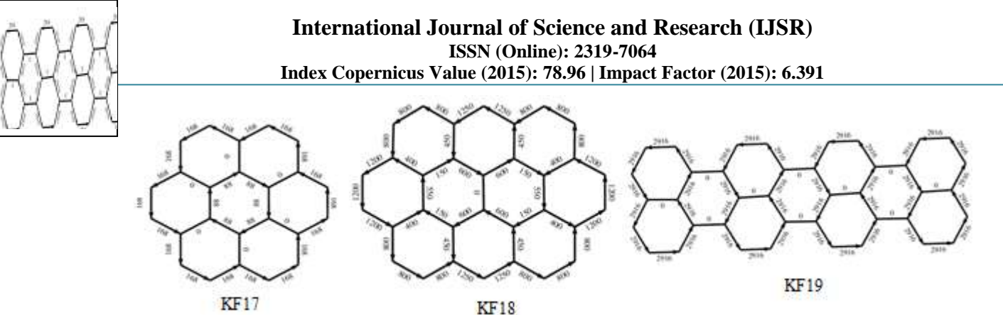
Figure 2: (a) the normalised ring currents and (b) the scaled ring currents of Randić of anthracene