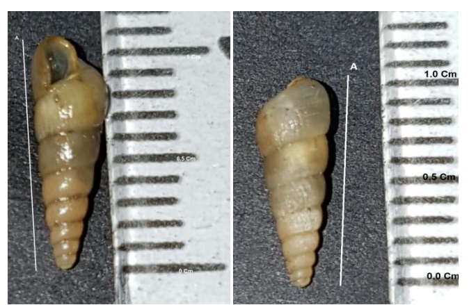
Figure 1: (a) A frontal side and (b) A dorsal side of P . achatinaceum . A/ meaning the length.