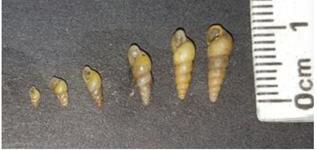
Figure 5: Developmental stages of P. achatinaceum