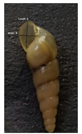
Figure 2: The aperture size of P. achatinaceum. A/meaning width and B/meaning length