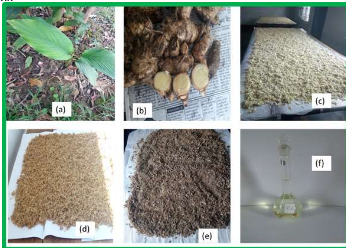
Fig. 1 Curcuma leucorrhiza Roxb.: (a) Growth of plant during April-July. (b) Transverse sectional view of fresh rhizomes. It appears colorless. (c) The cleaned rhizomes were sliced into small pieces. It appears white/ colourless. (d) After some days i.e. 2-3 weeks, the colour of the sample appears yellowish. (e) It completely dried after nearly 30 days of shed dry at room temperature. It appeared dark yellow in colour. (f) Solution of 1 g of dried powder per 100 ml deionized water after dissolution in ultrapure \text{HNO}_3 .