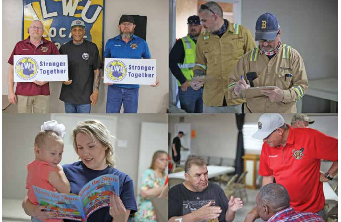
Unity in the desert: ILWU Local 30 in Boron, CA held a solidarity BBQ on May Day to unify and inform the membership about the ongoing contract negotiations with Rio Tinto. The ILWU Titled Officers and solidarity delegations from ILWU Locals 13 and 20 and Auxiliary 8 attended the event as a show of support from the ILWU family.