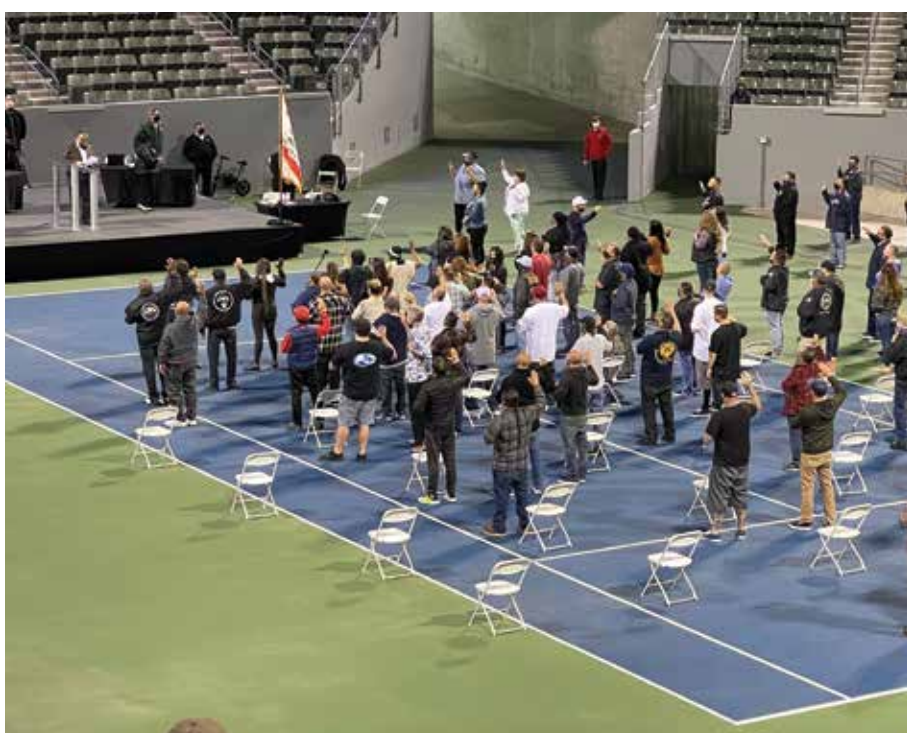
Elevated: Swearing-in of new Class A members was done in-person for the first time since March 2020. All others were done virtually on Zoom.