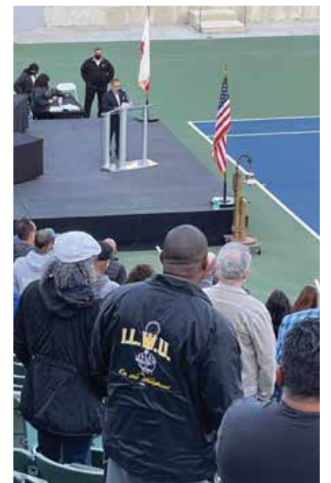
Moment of silence: Local 13 members stood while the names of all the members who passed since March 2020 were read aloud.

There are more than 5,000 Class A members in Local 13 and 1,070 were in attendance. In addition to the swearing-in of new officers who were elected during the recent March elections, the names of 165 members who passed and 70 who retired in the past year were also read. The mood was very somber when the 12 names were read of those who