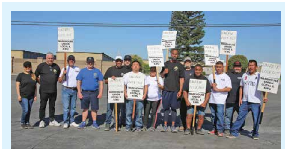
Locked out in Fresno: As The Dispatcher was going to press, ILWU Local 6 members in Fresno, CA were locked out by Stratas Foods after workers unanimously rejected the 2 meager percent increase in wages over 5 years offered by the company. These workers have been working four, 12-hour shifts per week throughout the pandemic, packing and shipping cooking oil for fast food chains and Costco. After being lowballed on wages for years, these workers have decided to take a stand for a fair wage increase. Stratas Foods generates approximately $700M in annual revenue. The Dispatcher will report on this fight in more detail in a future issue. In the photo: ILWU International President Willie Adams joined the picket line of locked-out Local 6 members and pledged the support of the International as these workers fight for a fair contract.