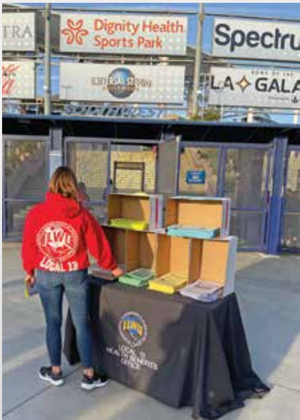
Local 13 holds in-person membership meeting in over a year page 2