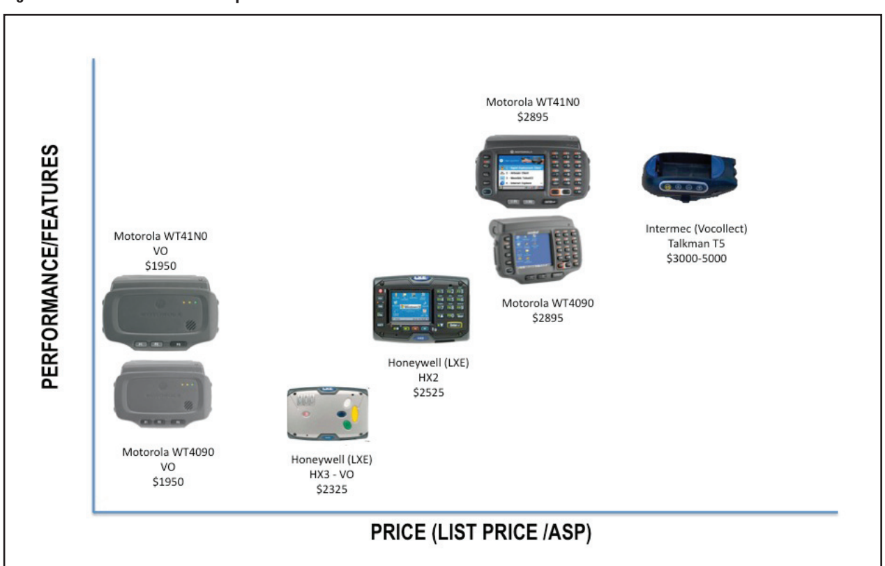
Figure 3: Price-Performance Comparison

The WT41N0 Series offers maximum performance and functionality in its product class, providing superb value for its price. The WT41N0 is ideal for customers who require a flexible, voice/text-based solution for use in all types of environments and working conditions (and that is similar in price to the competition's basic, voice only solutions). The WT41N0 VOW should be positioned only to those select customers who prefer a single-purpose, voice-only solution.